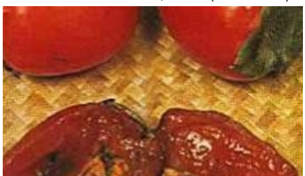
Detail of fruit and seed. (Unknown)

Fruit in Frascati (Italy) fresh fruit market selling for Italian Lire 4,000/Kg., i.e. $(US)2.00/Kg at exchange rate when picture was taken in December, 2000. (Putter CAJ)