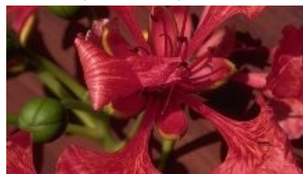
Flower of D. regia.