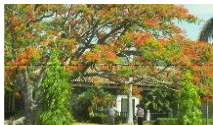
D. regia tree in flower, Zamarano, Honduras.

D. regia starts flowering in its 4th or 5th years. In Egypt, flowers appear in April with the 1st leaves and last for several months. In India, the tree remains leafless from March to May, the new leaves appearing at the end of the hot season in May or June. In moist places, the tree begins to develop young foliage before the flowering season and does not flower prolifically. It also flowers less prolifically on the shady sites than on the sunny sites. Planting of trees on dry sites therefore promotes copious flowering. In regions with heavy rainfall, every tree seems to follow its own rhythm of shedding of leaves and flowering. Pods of the previous year