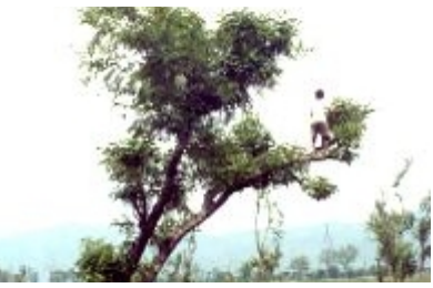
Dalbergia sissoo being lopped for fodder in southern Nepal.