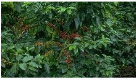
C. arabica mature fruit ready for harvesting. (David Boshier)

C. arabica flowering flush after rain. (David Boshier)