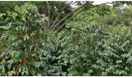
Ripe yellow casturi coffee (Trade winds fruit)