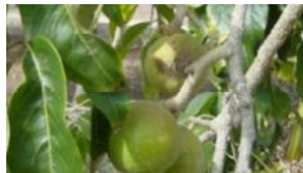
Fruit cluster (Trade winds fruit)