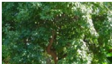
Near-ripe fruit cluster (Trade winds fruit)