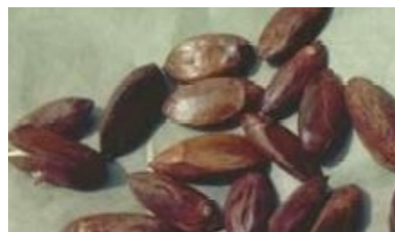
Mature kernels-in-testa (French B)

The trees flower mainly in the dry season and fruit during the wet season. In Vanuatu, fruits ripen between October and March. In New Britain fruiting occurs twice annually, between August and November and then again from April to May. Insects probably effect pollination. The fruits are dispersed by fruit-eating pigeons, wild pigs, rodents and monkeys, and are occasionally eaten and dispersed by bats. Humans gather the fallen fruits and seeds, and may thus be considered a constraint to the successful dispersal of the species, significantly reducing the natural stand of seedlings in communities and forests