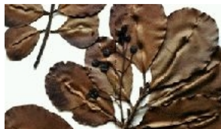
Calophyllum inophyllum leaves and fruit (Zhou Guangyi)