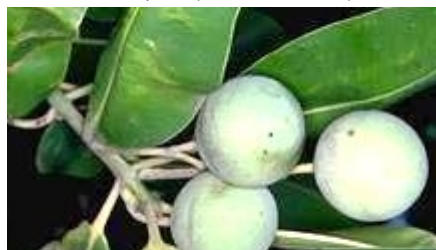
Leaves at Kalepolepo Kihei Maui, Hawaii