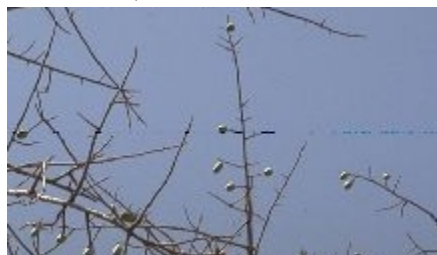
Bombax costatum flowers