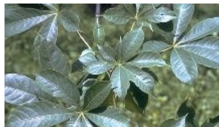
Bombax costatum leaves