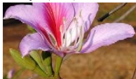
Flower (Ellis RP)