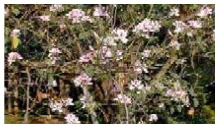
Flowering tree (Ellis RP)

In its natural habitat in India, the tree is deciduous, remaining leafless from Jan-Feb to April with leaf fall in Nov-Dec. Flowering occurs when the plant is leafless. Tree starts flowering at a very early age of 2-3 years. The seeds disperse from the pods and germinate on sites with favourable light and moisture conditions, while in unfavourable niches the radicle dries up or is destroyed by birds.