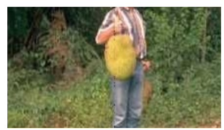
15kg fruit from trees in Sri Lanka (Pushpakumara)

Trees start flowering and fruiting 2-8 years after planting. Flower and fruit