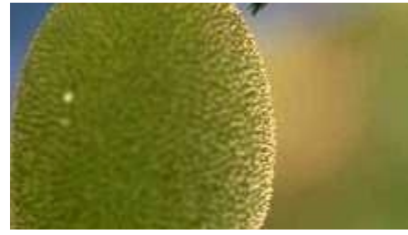
Close-up of female infloresence (Anthony Simons)