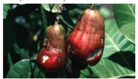
Anacardium occidentale foliage