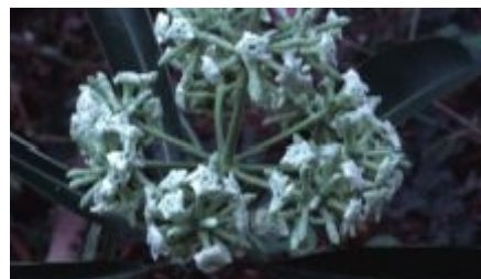
Alstonia scholaris (Chongrak Wachrinrat)

Bengali (satiani, chattin, chatium); Burmese (lettok); English (white cheesewood, birrba, milkwood pine, milk wood, milky pine, black board tree, devil's tree, dita bark); Filipino (dita, dalipoen); Gujarati (satuparni); Hindi (chatian, satni, satwin, saitan-ki-jhad); Indonesian (rite, pulai, pule); Javanese (pule); Lao (Sino-Tibetan) (tinpet); Malay (pulai, pulai linlin); Nepali (chhatiwan, chhataun); Sanskrit (saptaparna); Tamil (elalaipalai, palegaruda, pala); Thai (sattaban, teenpet, teenpethasaban); Trade name (pulai, shaitan wood, chatiyan wood, white cheese wood); Urdu (chatiana); Vietnamese (caay suwxa, caay mof cua)