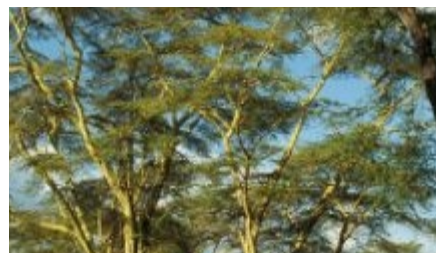
Grove of fever trees, Nogorongoro Crater, Tanzania. The name "fever tree" comes from the association of this tree with low lying, wet areas, which are prime habitat for mosquitoes that carry malaria.

After pollination by insects, the development of the fruit takes 4-6 months. In southern Africa, flowering occurs from September to November while fruiting is from January to April. Despite the production of a large number of flowers, often only a few pods develop.