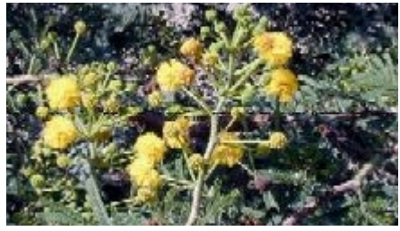
Deep golden yellow pom-pom like flowers borne in long, loosley packed terminal panicle-like sprays. Synchronised flowering occurs at regular intervals throughout spring and summer. Srongly scented and provides excellent bee food. (Ellis RP)