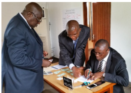
Members of the Interministerial Committee for the Regulation of the Oil Palm Supply Chain negotiate agreements between small oil palm producers and the agro-industry in the CoPalCam game developed by the OPAL project. The game was developed to explore the resilience of the supply chain in Cameroon. Similar models exist for Indonesia and Colombia. Yaounde, 2016.