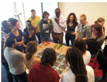
Participants share their insights during the debriefing after a game session of the ReHab game (Le Page et al 2016).