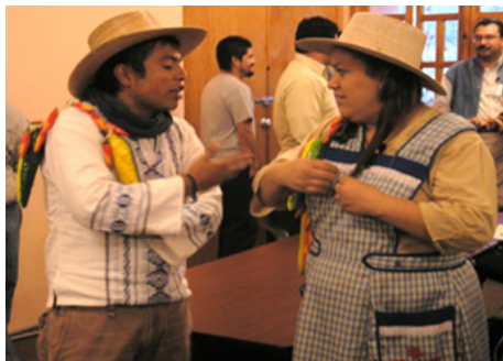
Participants enacting stakeholders and negotiating mutual beneficial alternatives.