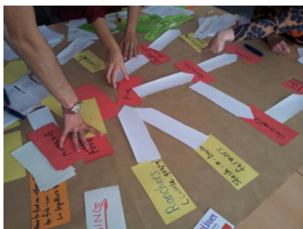
The first step of game development: Conceptualising the social-ecological system of the system at play.