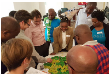
Members of the FSC Congo Basin Regional Working Group on High Conservation Values use the MineSet game developed by the CoForSet project to define new management rules for FSC concessions and the integration of the Intact Forest Landscapes in the standards. Brazzaville, August 2017.

Deciding whom to work with, whom to play with and whom to talk to are the three most critical questions to address when aiming to bring change in a system. These questions reflect the level of desired transdisciplinarity in the team, engagement and monitoring needs. For the selection of players, it is important to develop a clear overview of the stakeholders involved and where they can be placed on the scales of 'power to change the issue' and 'level of impact experienced'.