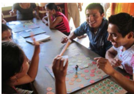
The next generation of Mexican smallholder farmers discussing how to manage their individual and collective interest.

Games are increasingly proving powerful tools for learning and exploring and negotiating alternative management in a large range of systems. These include small coffee farms in Mexico 13 , overgrazing in west-African savanna landscapes 14 , groundwater management in India 15 , and rubber-oil palm landscape transitions in Sumatra 16 . Nonetheless, games still often face a strong dose of prejudice. Many people associate games with leisure rather than serious activity. While this prejudice can be an initial disadvantage, it is at the same time also one of the main strengths of using games. The fact that a game setting is regarded as not so serious and fictional makes it often easier for people to interact, share their perspectives and discuss issues in an open manner. In fact, in questionnaires the game dimension may be underrated, while choices made in games can be more genuine reflections of preferences.