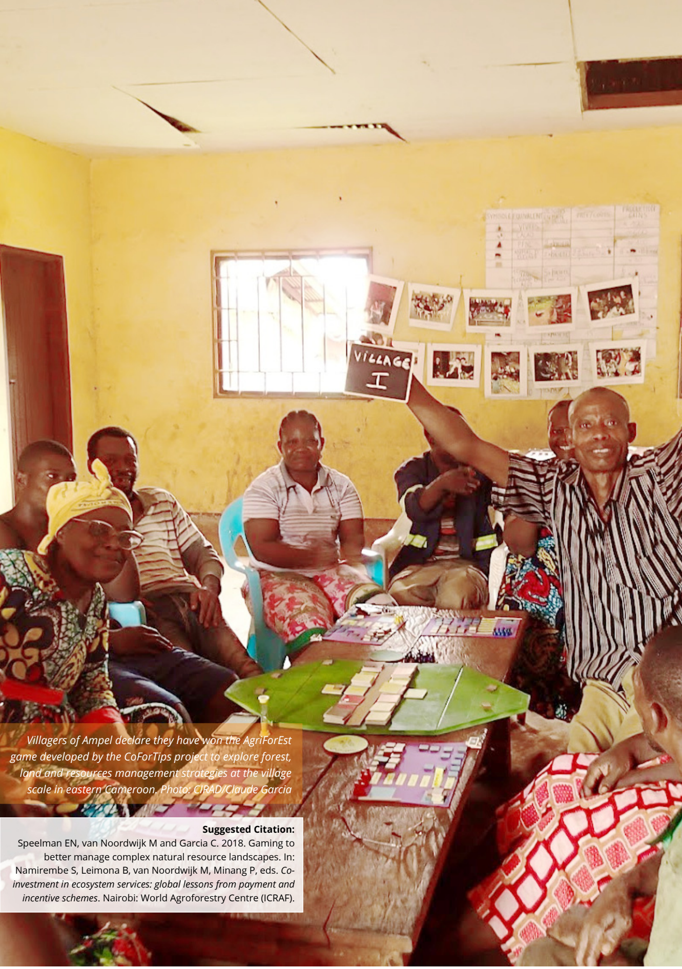
Villagers of Ampel declare they have won the AgriForEst game developed by the CoForTips project to explore forest, land and resources management strategies at the village scale in eastern Cameroon.