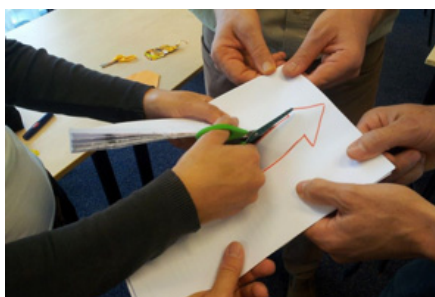
The first step of game development: Conceptualising the social-ecological system of the system at play.

Every game developer wants to design a game that engages its players, stimulates them to actively participate and learn from the dynamics of the game and the interaction with fellow players. While this task can seem daunting at the start, several methods are available to guide one through this process. 23,24,25