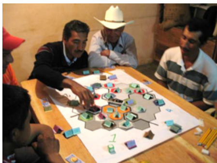
Local farmers discussing land planning strategies during a game session of RESORTES. The game was developed to facilitate discussion and negotiation on territorial planning in the south of Mexico.