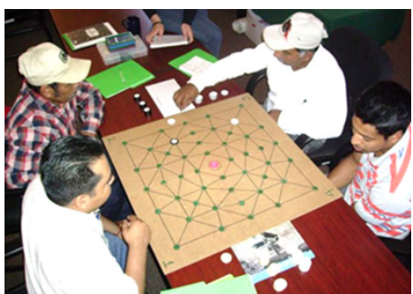
Smallholder farmers discussing how to meet individual and collective land management goals in the Sierra Springs game.

social dynamics. In particular, games aiming at local learning often function as boundary objects 11 , allowing participants to share and discuss their often-contrasting interests and perspectives of the issues at hand. When thinking of the six-types of knowledge-related human skills, games can be seen as platforms for change (Figure 24.2) 12 which can be used at any of the levels between global to individual incorporating and exploring all six steps in the figure.