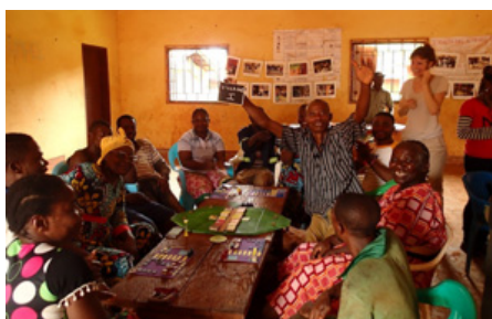
Villagers of Ampel declare they have won the AgriForEst game developed by the CoForTips project to explore forest, land and resources management strategies at the village scale in eastern Cameroon. Ampel, 2016.