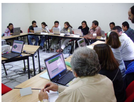
Workshop participants exploring the impact of management on a complex agricultural landscape.