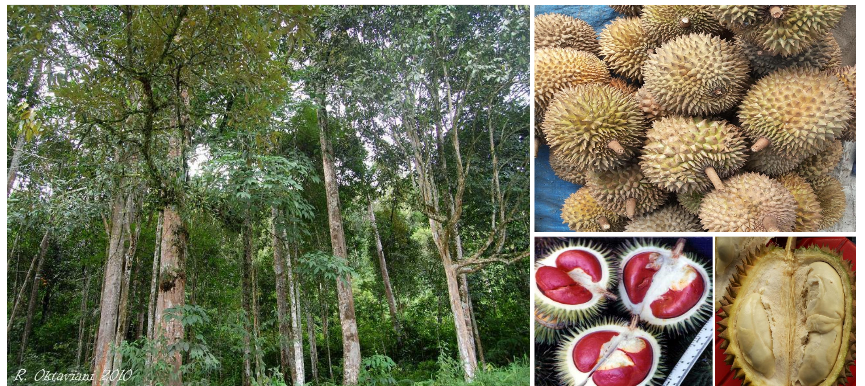
Figure 1 (Clockwise). Durian agroforestry systems in Tapanuli, North Sumatra. Durian fruits. Flesh of durian ( Durio zibethinus ). Red durian ( Durio graveolens ).