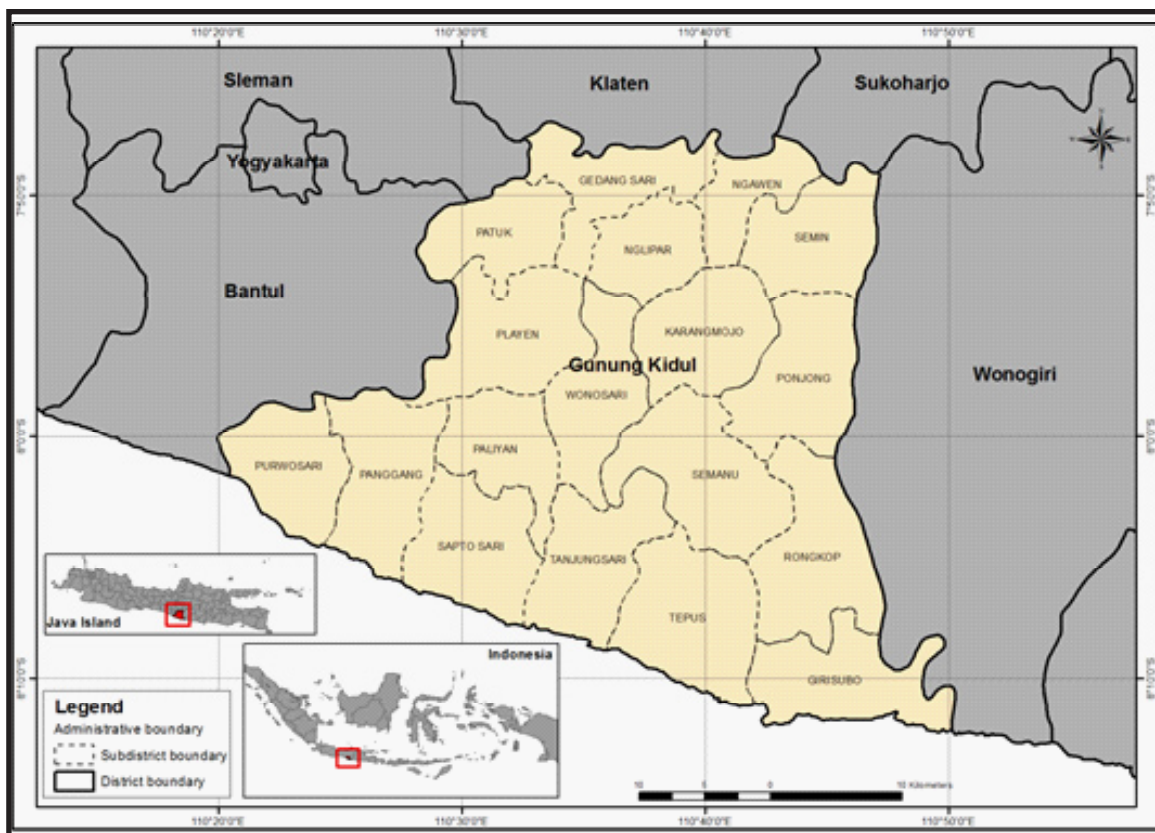
Figure 1. Map of Gunungkidul Province (Special Region).

the economic value, followed by forestry (27.3%), livestock (6.3%), plantation crops (1.7%), and fisheries (0.7%). The average land-holding per family is 1 ha, varying from 0.5 to 3.0 ha, and consists of multiple parcels. Common agricultural crops are rice ( Oryza sativa ), cassava ( Manihot utilissima ), peanuts ( Arachis hypogaea ), soy beans ( Glycine max ), corn ( Zea mays ), bananas ( Musa spp ) and other vegetables (Rohadi et al. , 2011).