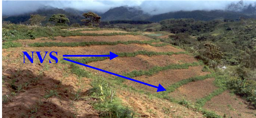
Figure 1. Natural Vegetative Strips (NVS)

2002; Stark 2000; Catacutan 2005). The NVS provide minimal below and above ground competition effects, and are effective in filtering field run-off by more than 90 per cent in a sloping farm of 40-60 per cent slope (Garrity et al. 2002; Garrity et al. 1998; Catacutan 2003, 2005). The NVS also serves as a foundation for agroforestry development in sloping farms, where farmers enriched the grass-strips (NVS) with fruit and timber tree species. To make quality tree planting materials readily available, farmers were trained on seedling production and established more than 500 nurseries of timber and fruit trees. The Landcare program has become phenomenal, and received national recognition as an outstanding agroforestry program in 2003. More and more LGUs, NGOs and foreign-funded projects have expressed interest to learn about Landcare.