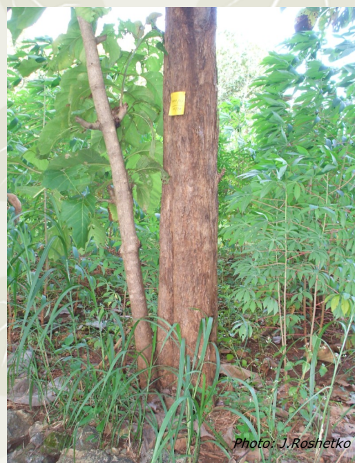
Tegalan system in homegarden

One option to make early heavy thinning more acceptable is to establish teak in mixed plantations with short-rotation species such as Gmelina arborea or Paraserianthes falcataria . Harvesting the short-rotation species after 5 years would constitute early heavy thinning with economic return. Selection of short-rotation species should be based on local market demand. Computer simulation has shown that net present value and return to labor for smallholder teak systems is enhanced when farmers practice silviculture management, with benefits generated from both agriculture and timber crops.