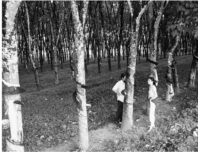
FIGURE 2 A 'legible' and 'legitimate' landscape according to the Maoist perception of nature as an environment to be completely domesticated so that it will serve mankind: rubber plantation in Menglong Township, Jinghong County, Xishuangbanna.

Shifting cultivators in Xishuangbanna such as the Lahu, the Hani and the Jinuo were thought to represent a primitive mode of production. Based on this appraisal, ideologically driven planners concluded that state rubber farms needed to be staffed by people whom they saw as the more 'educated' and 'advanced' peasants, that is, by Han Chinese farmers and 'educated youths' resettled at the 'frontier' of inland China. Those 'advanced' peasants were organized collectively in rubber plantations to become state workers representing forces of production in the socialist model. This reflected a general trend towards managed, 'legible' landscapes (Table 2).