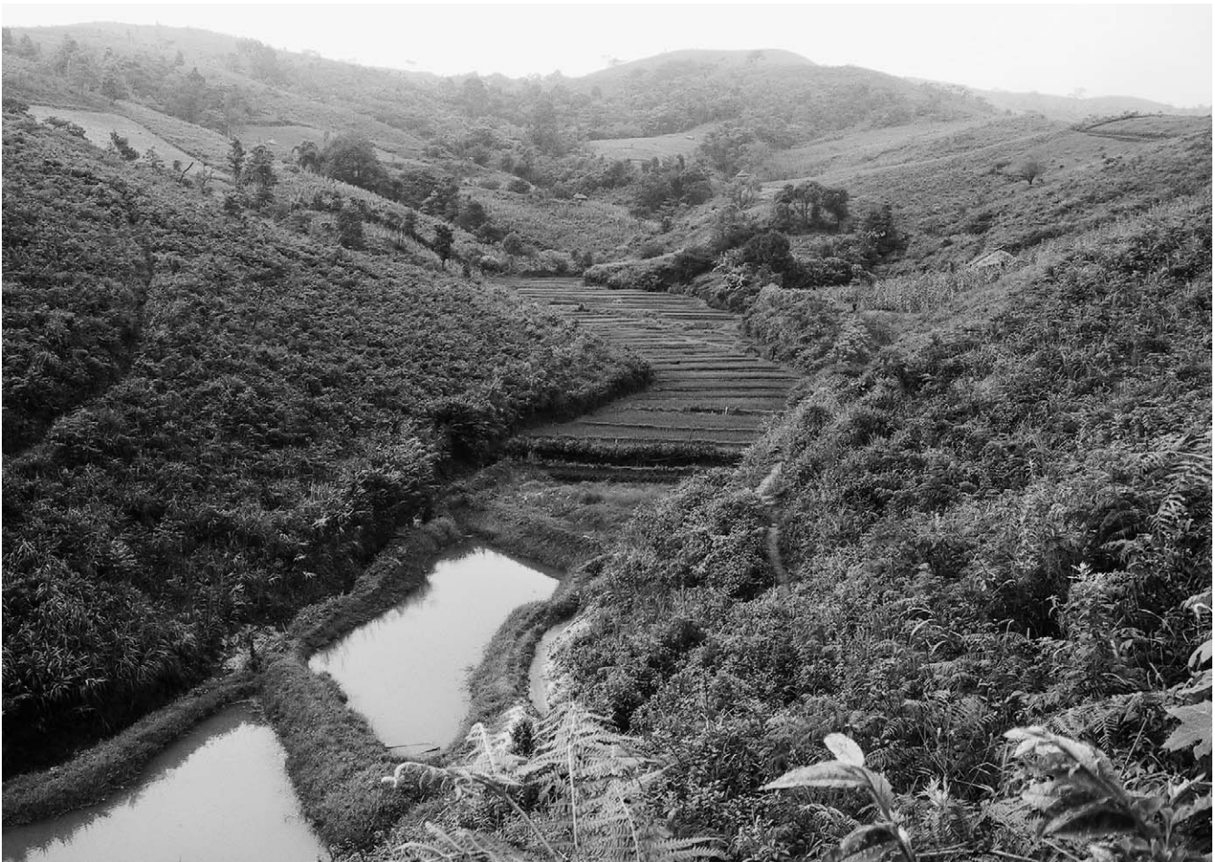
FIGURE 3 Example of the type of land use considered by the government as 'backward,' unproductive, and environmentally detrimental: swidden-fallow landscape with fishponds, paddy, rainfed crops, fruit trees, fallow, etc in Mongsong Hani Administrative Village, Menglong Township, Jinghong County, Xishuangbanna. Today, the value of such mixed management is assessed far more positively.

With economic reform in the late 1970s, disillusioned 'educated youths' working in Xishuangbanna initiated what became the 'Return to the Cities' national protest movement. Many state rubber farms nearly collapsed. Some upland Hani villages were persuaded to move to lower altitudes to provide state workers to meet the labor deficit after the departure of the 'educated youths.' In order to make them more efficient