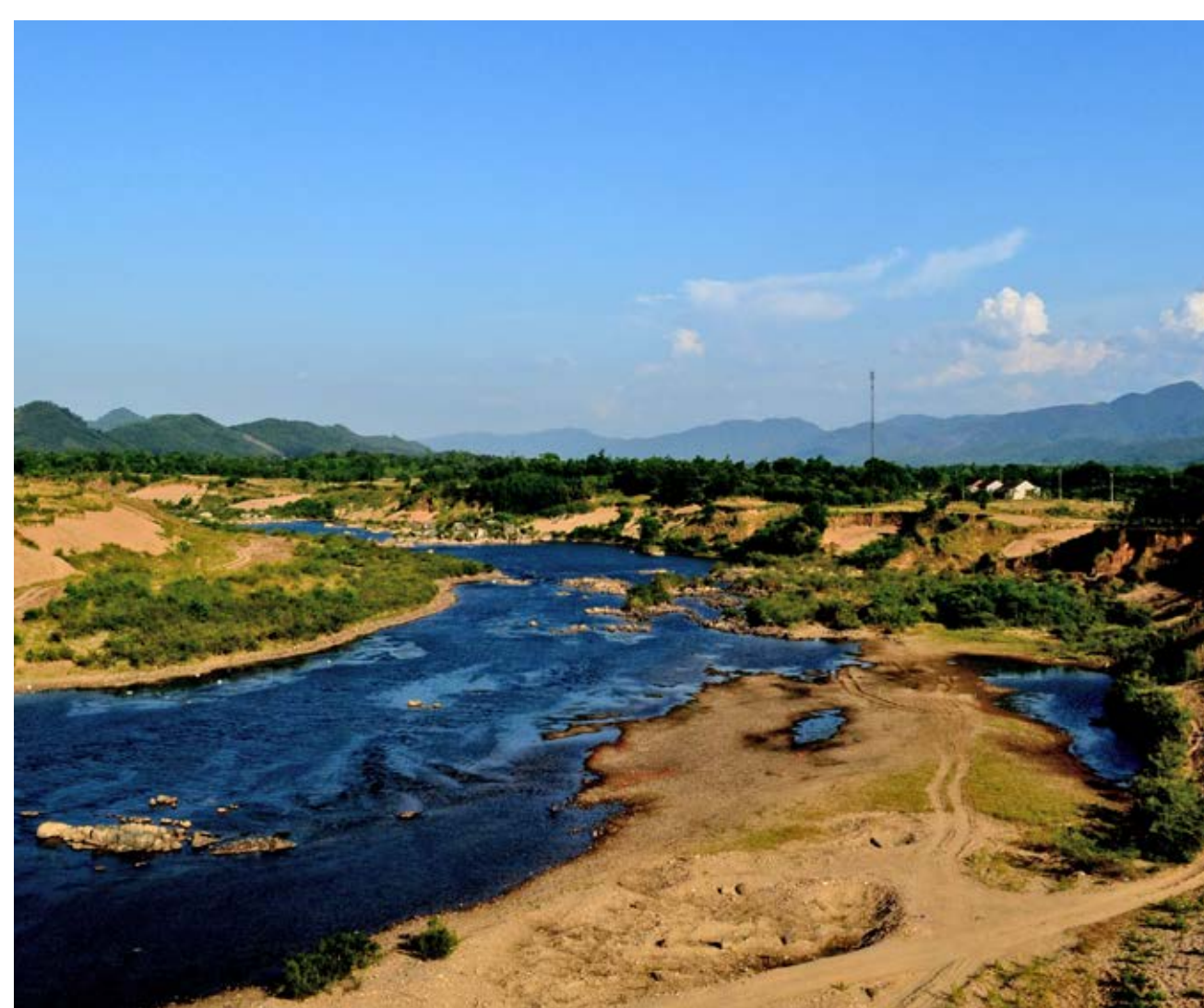
Before the drought, the river was really beautiful, however the river now is covered by white sand due to the prolonged drought. (Photo: ICRAF VN/Farmer name: L.N)