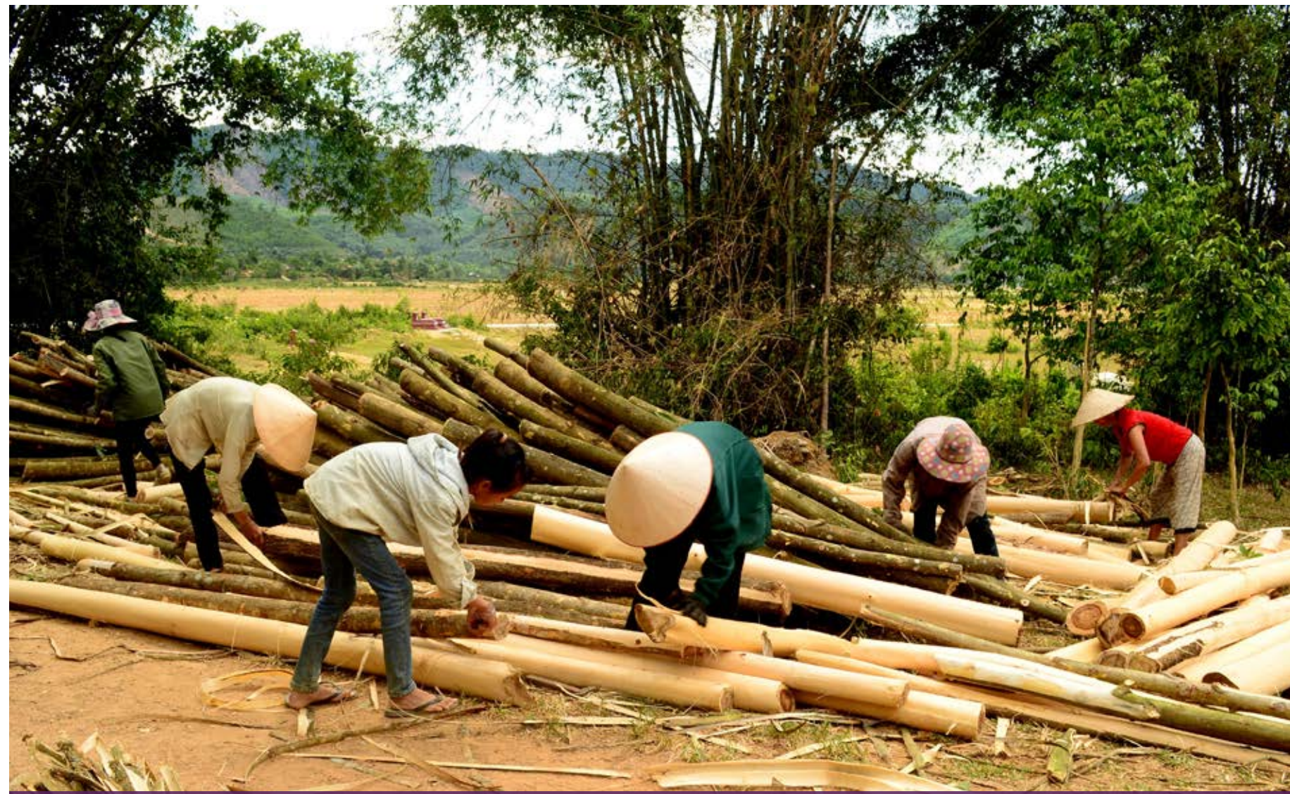
Plantation forests are the main source of income. The forest provides income for people here, to meet the needs of livelihood, education.