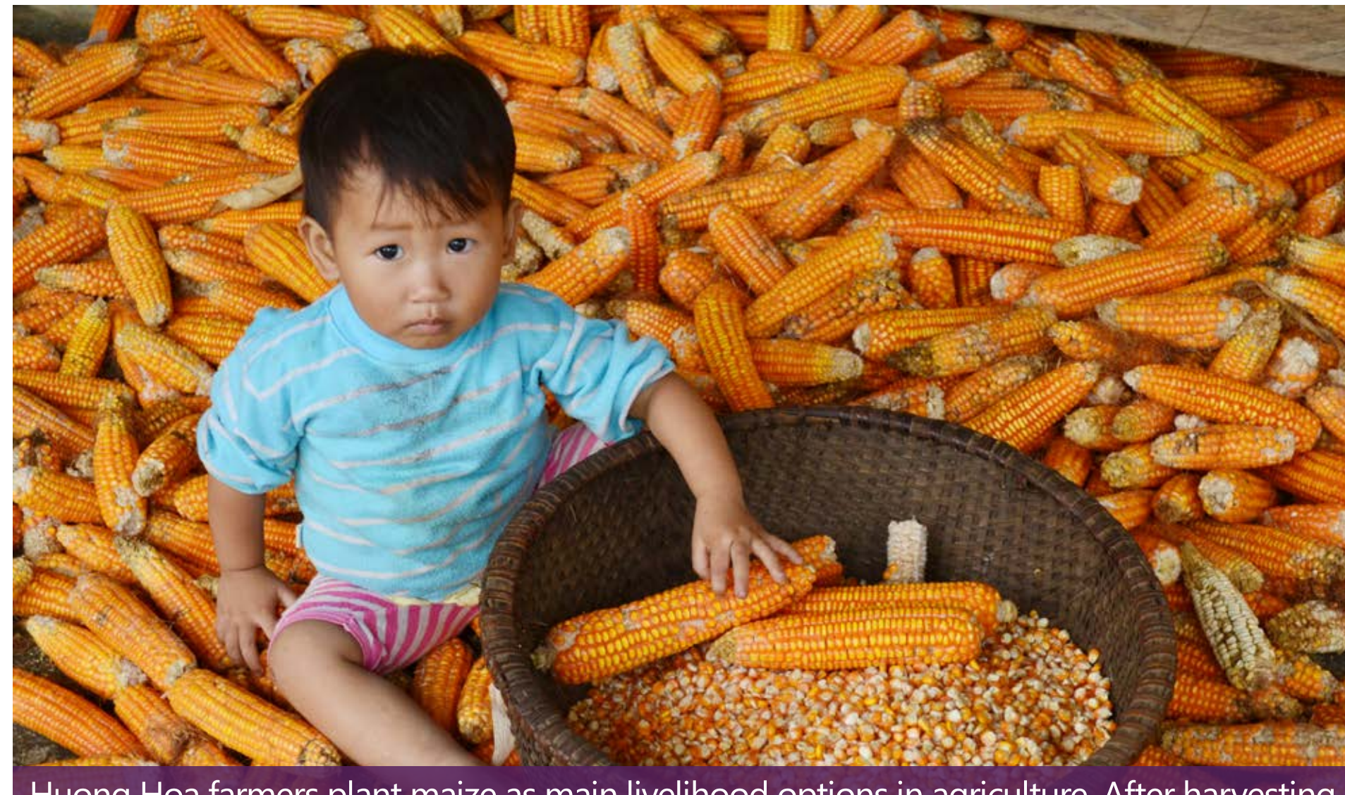
Huong Hoa farmers plant maize as main livelihood options in agriculture. After harvesting, the little boy's family will husk corn to cope with the food scarcity for livestock in cold spell.