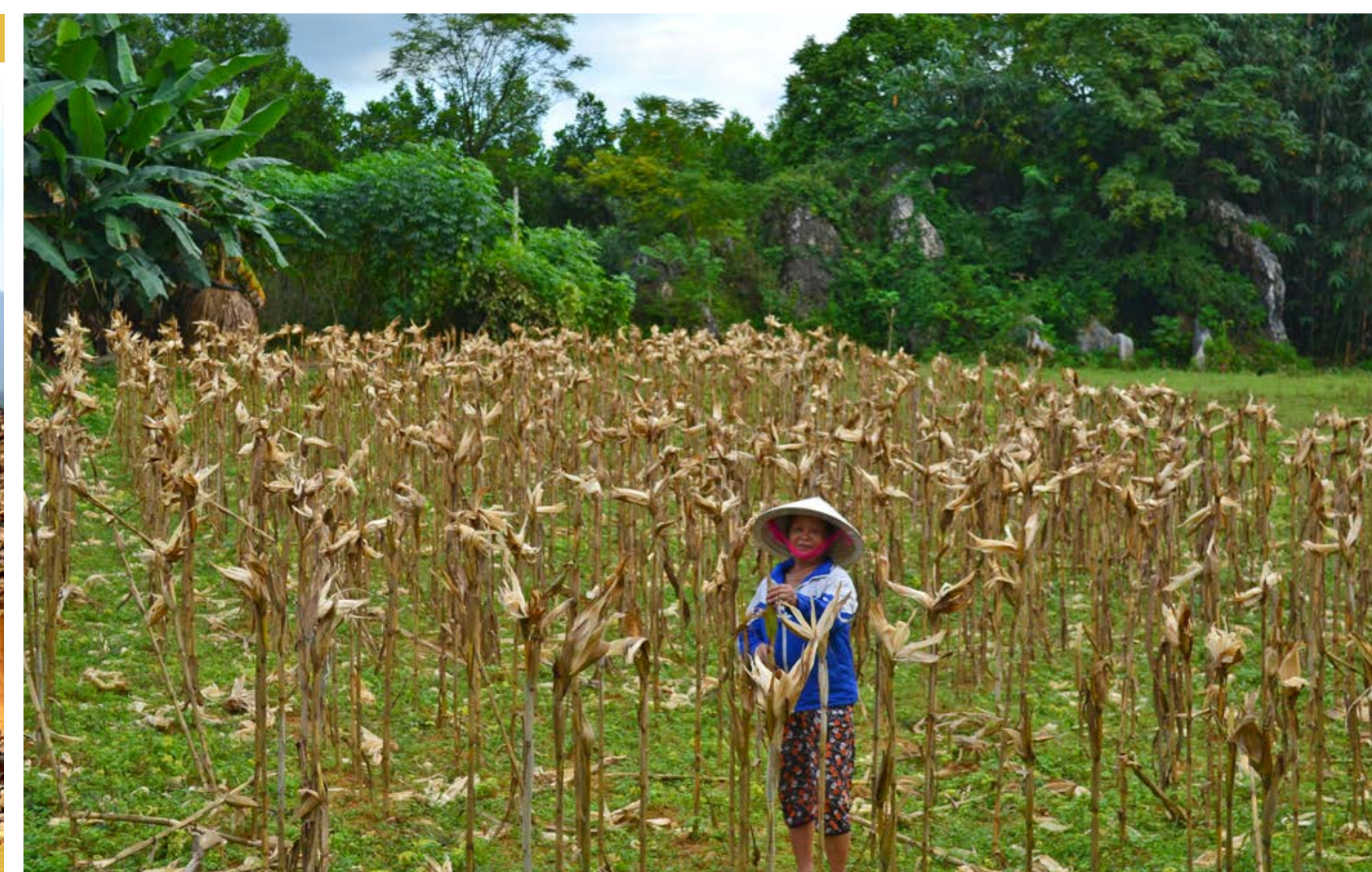
The drought has made our crop failed to harvest. (Photo: ICRAF VN/Farmer name: L.N)