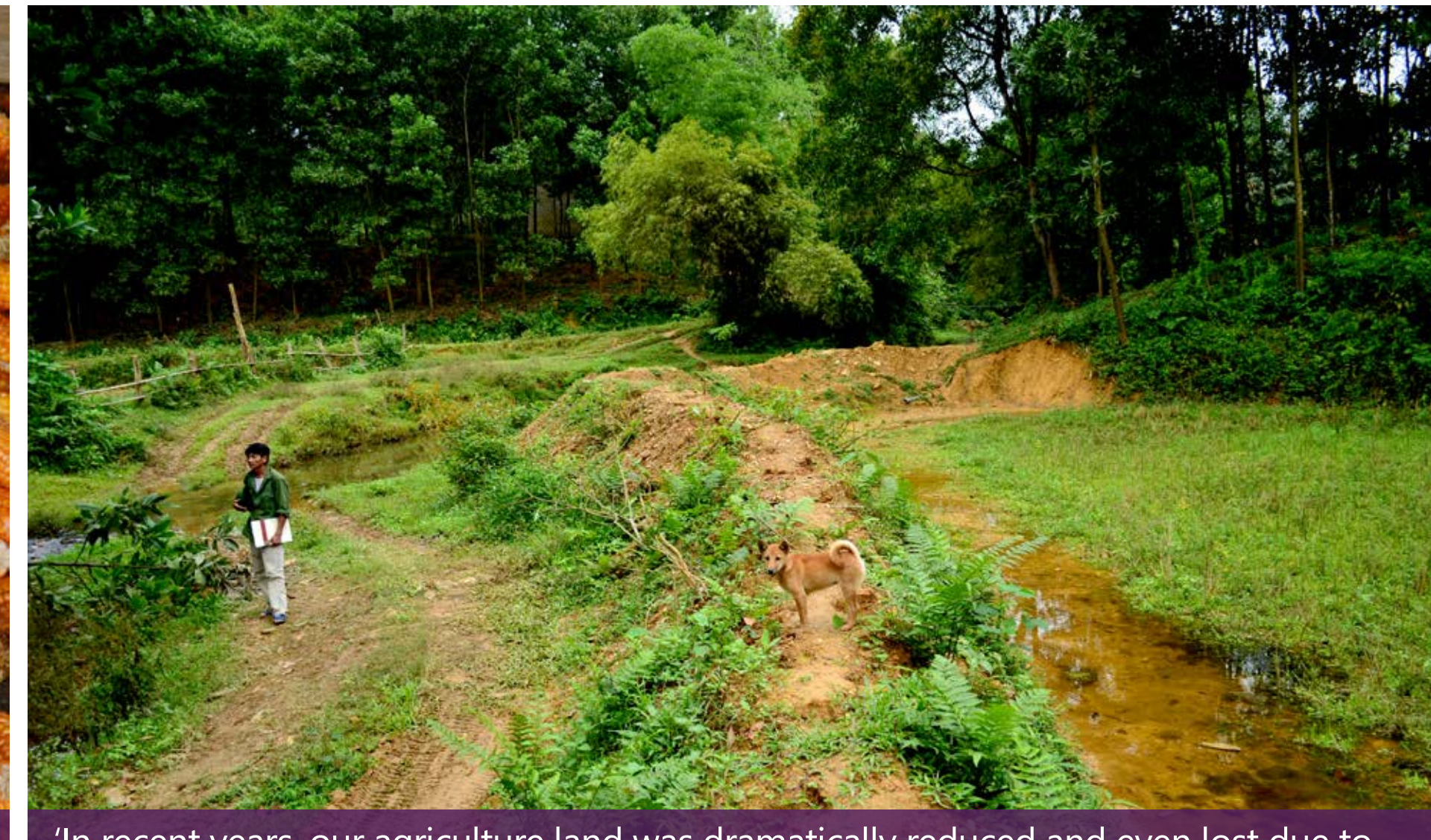
'In recent years, our agriculture land was dramatically reduced and even lost due to landslide and stone sedimentation, so we built the dike to cope with the problems'. (Photo: ICRAF VN/Farmer name: T.C)