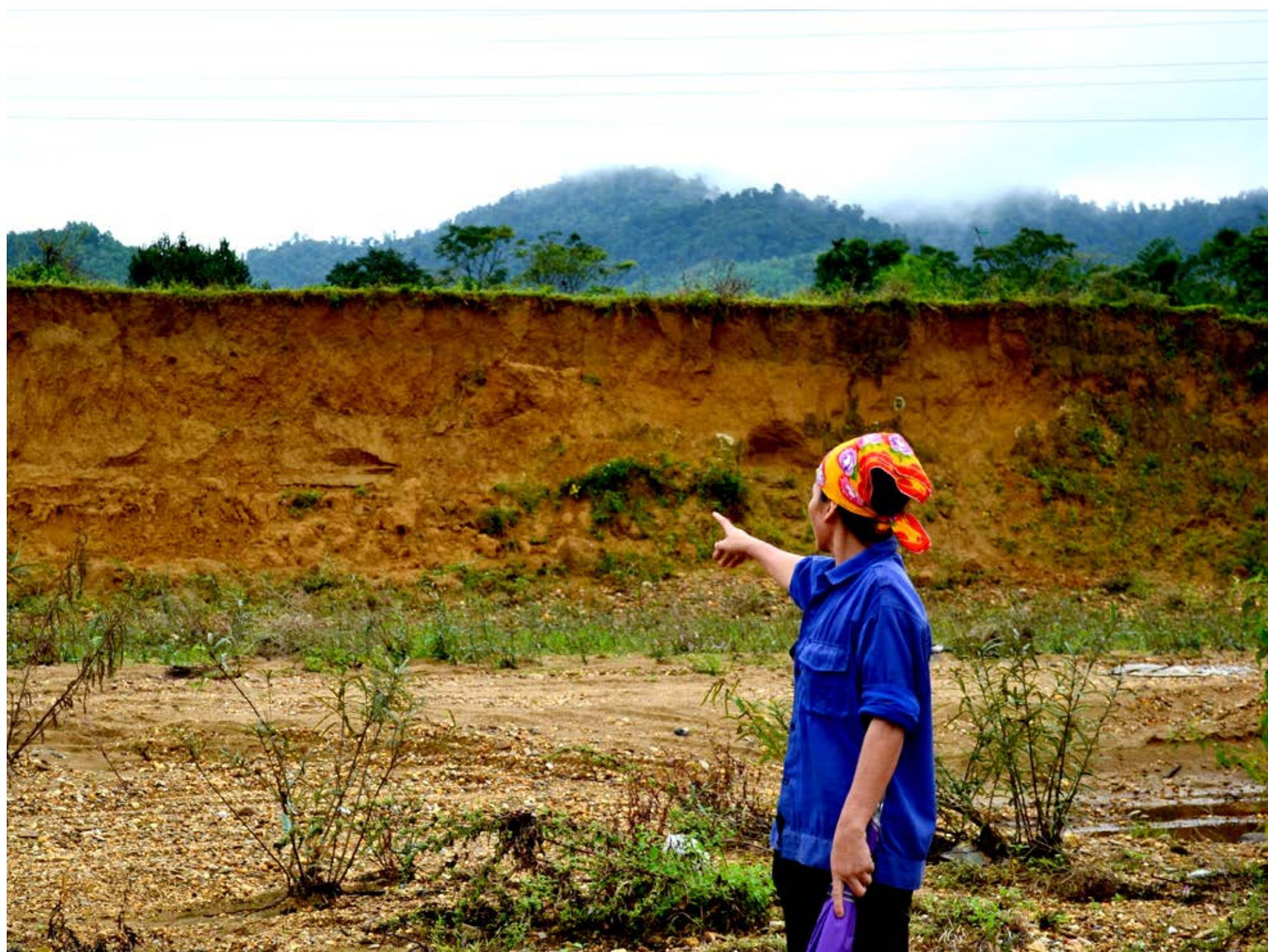
The landslide on the agriculture land of smallholder caused by flood and storm lead to the reduction and loss of a large part of the area. (Photo: ICRAF VN/Farmer name: N.T.T)