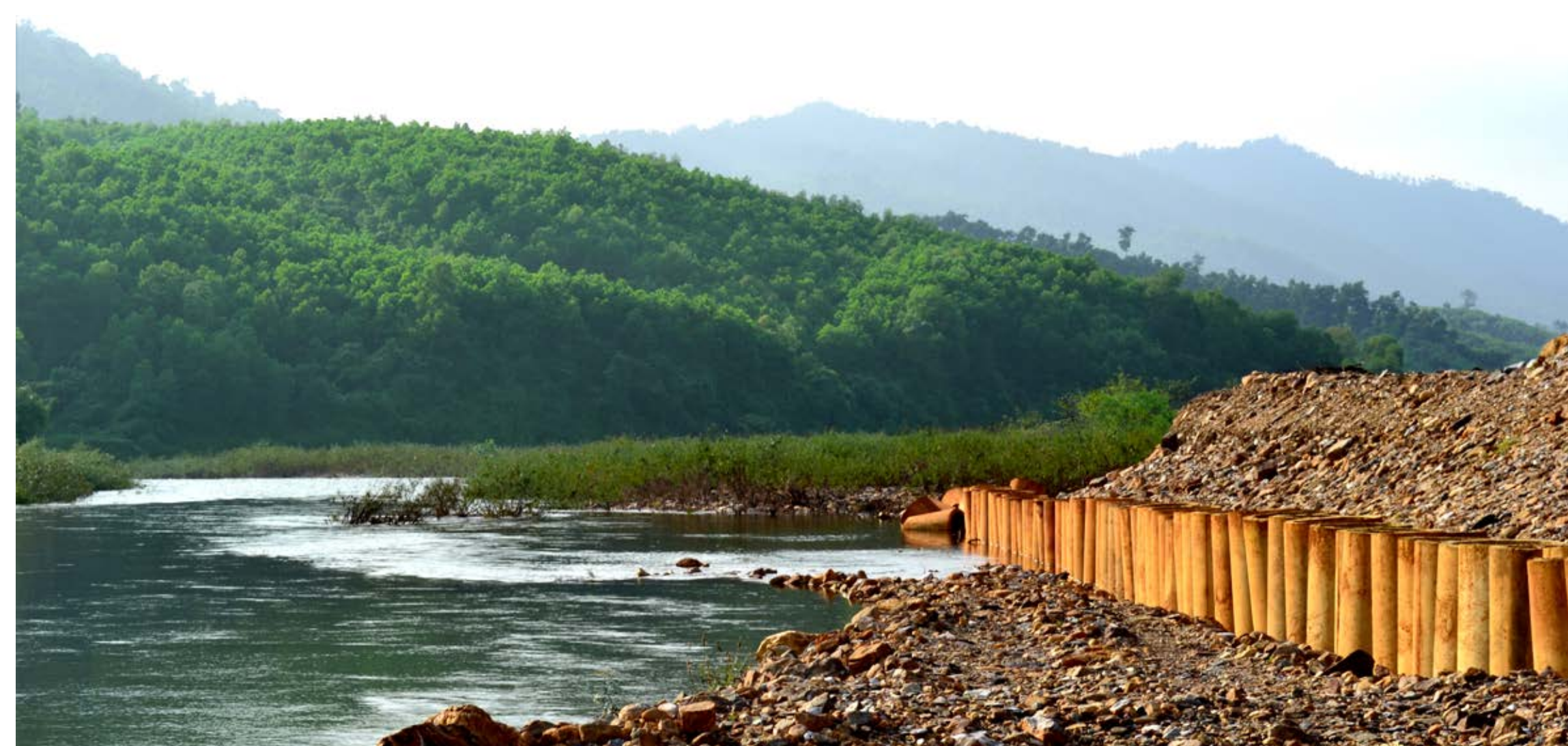
The whole agricultural land is buried with gravel and pebble. The owner has lost almost all his land. (Photo: ICRAF VN/Farmer name: L.N)