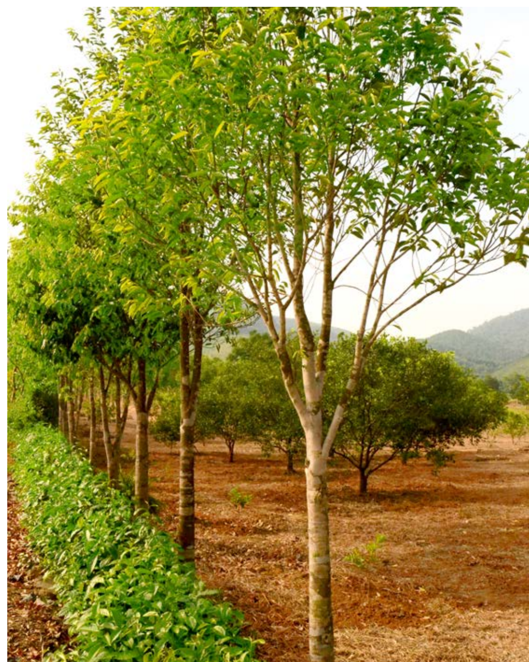
The agroforestry products such as pomelo, tea, and orange significantly contribute to the family income.