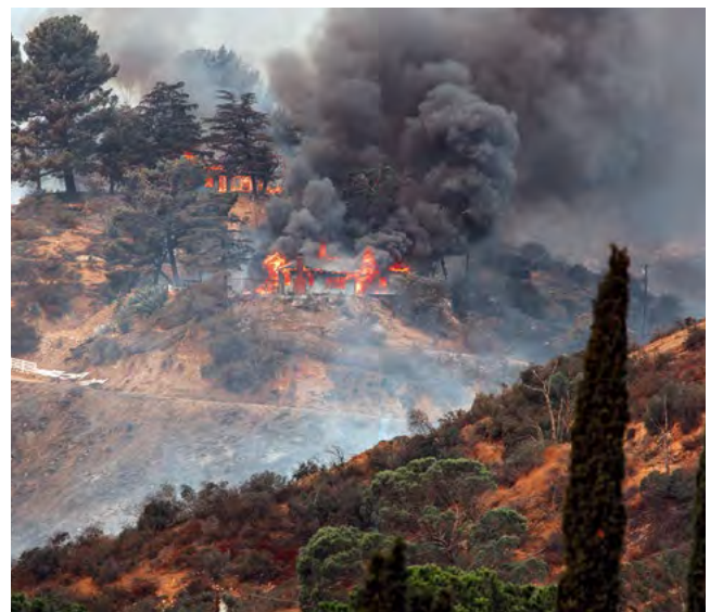
La Tuna wildfire in Los Angeles, CA in 2017

In the immediate aftermath of wildfires, the burnt soil is bare and dark, and highly susceptible to erosion,