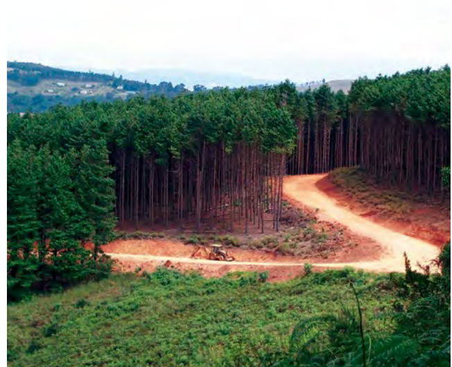
Pine plantation in South Africa

Plantation forests are becoming increasingly common and represent approximately 7% of the world's total forest area (Payn et al., 2015; FAO, 2015). Highly managed conditions, which include stand fertilisation, thinning, regular tree spacing, genetically improved growing stock, controlled burning and other practices, are designed to increase the growth rate and wood quality (Fox et al., 2004). Management practices increase growth by maximizing leaf area and growth efficiency (Waring, 1982). Increased leaf area can increase water demand by trees (Scott et al., 2004).