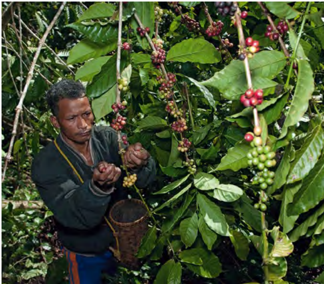
Coffee is a commodity of the Wae Rebo people in East Nusa Tenggara, Indonesia. Their coffee plants are directly adjacent to natural forests