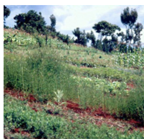
Figure 2. N-Fixing legume cover crops and biomass transfer from multipurpose trees

Farm-generated organic nutrient resources can boost agricultural production in resource-poor households. Decision guides can assist in targeting different technical options according to soil parameters, land size and market access.