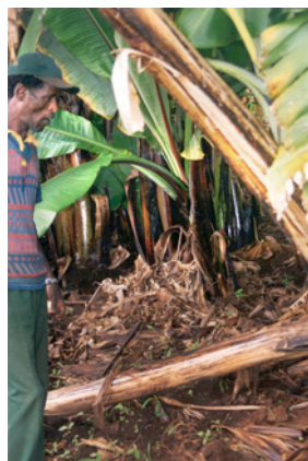
Figure 1. Farmyard manure with perennial and annual crop residues