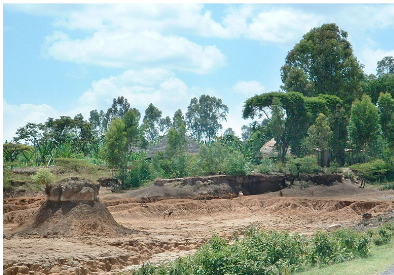
Land degradation became a threat to livelihoods in African Highlands, Wollaita, Ethiopia.

NRM agendas demand high levels of farmer participation and control in the research and development process. Involvement of a number of specialists working beyond their areas of expertise helped to improve the system through better integration. In Areka,