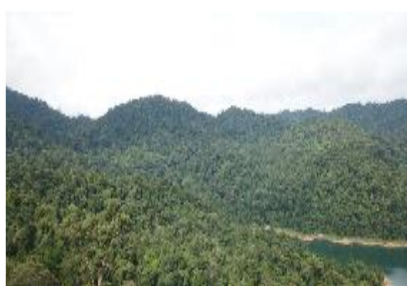
Forest in Terengganu