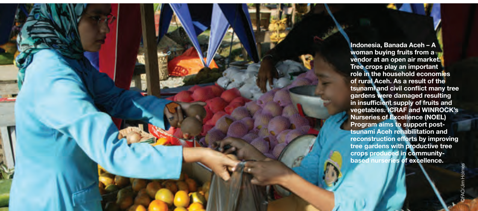
Indonesia, Banada Aceh – A woman buying fruits from a vendor at an open air market. Tree crops play an important role in the household economies of rural Aceh. As a result of the tsunami and civil conflict many tree gardens were damaged resulting in insufficient supply of fruits and vegetables. ICRAF and WINROCK's Nurseries of Excellence (NOEL) Program aims to support post-tsunami Aceh rehabilitation and reconstruction efforts by improving tree gardens with productive tree crops produced in community-based nurseries of excellence.

They are designed as an entry point for policy creation or change. In cases where agroforestry policy is completely absent, they can assist in creating awareness of agroforestry systems and show how policy issues can be addressed, through innovative policy design taking trees, crops and animal production into account. In other cases, where agroforestry is recognized in policy frameworks, the guidelines can assist in improving the economic, social and policy context, so that incentives for practising agroforestry are strengthened.