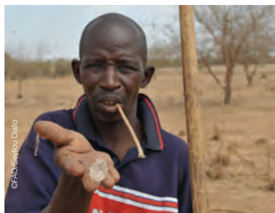
Senegal, Thikene Ndiaye - Acacia Operation. Support to Food Security, Poverty Alleviation and Soil Degradation Control in the Gums and Resins Producer Countries (Burkina Faso, Chad, Kenya, Niger, Senegal, Sudan). A local villager tending a crop of acacia trees showing the sap or gum arabic that is harvested for eventual sale to a processing plant. (FAO Project)

This development, which fosters a regeneration of the whole parkland, is directly dependent on the commercial interests of the companies in charge of distribution of the product. It is questionable whether free distribution of seedlings to farmers is a good solution, as it creates economic and technical dependency instead of promoting innovative behaviour. However, this case provides an example of a situation in which the maintenance of trees in rural areas derives directly from market demand.