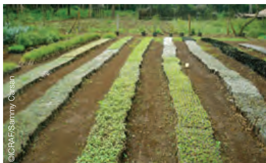
Kenya, Kisumu – An ICRAF pilot initiative exploring the potential benefits offered by urban agroforestry. The aim is to integrate agroforestry technologies into present peri-urban and urban farming practices in Kisumu.

The government is also considering various options to increase agroforestry tree seed and seedling supply to meet the demand created by this regulation.