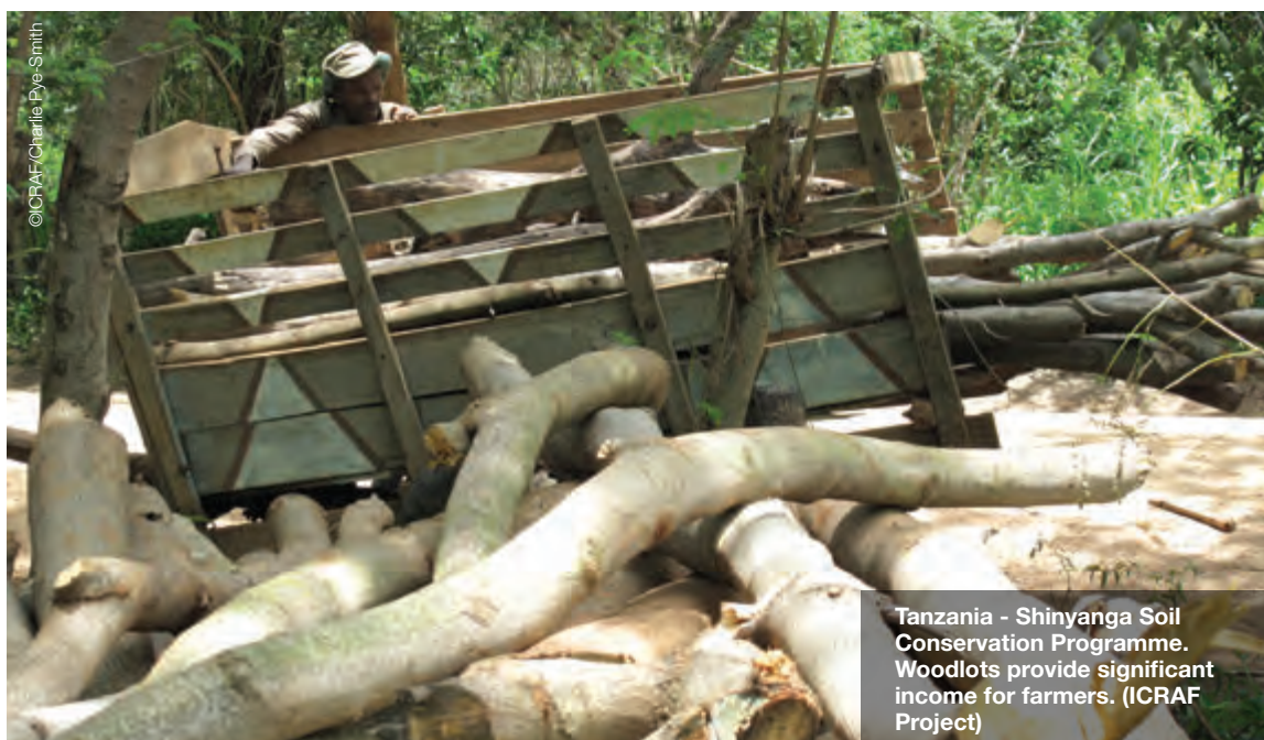
Tanzania - Shinyanga Soil Conservation Programme. Woodlots provide significant income for farmers. (ICRAF Project)

Poor regulation of state-owned and managed woodlands and forests has led to undervaluing concessions and stumpage charges, resulting in an oversupply from those sources and an undersupply from farms. A weak governance context leads to instability and eventually to unsustainability of the local economic system. It never promotes complex integrated systems such as agroforestry.