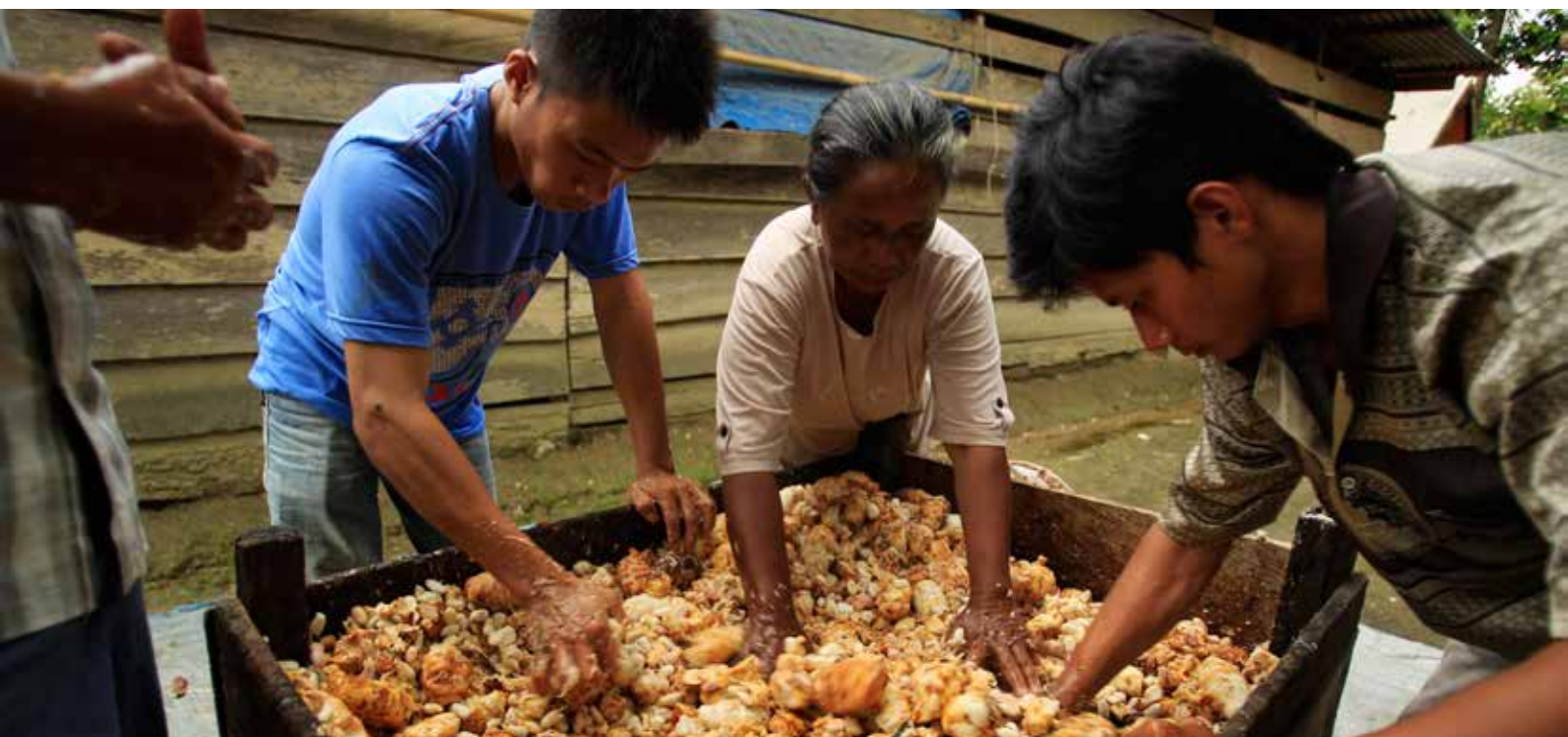
Cocoa Farmers in South and Southeast Sulawesi.

Agroforestry has been increasingly recognized as having a central role in sustainable agriculture, generating robust knowledge on the role trees play in production landscapes and the multiple benefits they deliver – from combating climate change and contributing to food production and household nutrition, to providing sustainable fuel and timber (Dufflo and Udry, 2004; Mbow et al., 2014). Women farmers are an integral part of agroforestry systems, as they are often responsible for managing trees, especially at the early stages of establishment (Kiptot et al., 2014). Women are often the majority of those who cluster on marginal, degraded lands with insecure tenure (Dufflo and Udry, 2004; Agrawal, 2001), yet their roles in tree-based agricultural production systems and the complex gender relations that shape decision-making have received minimal research attention.