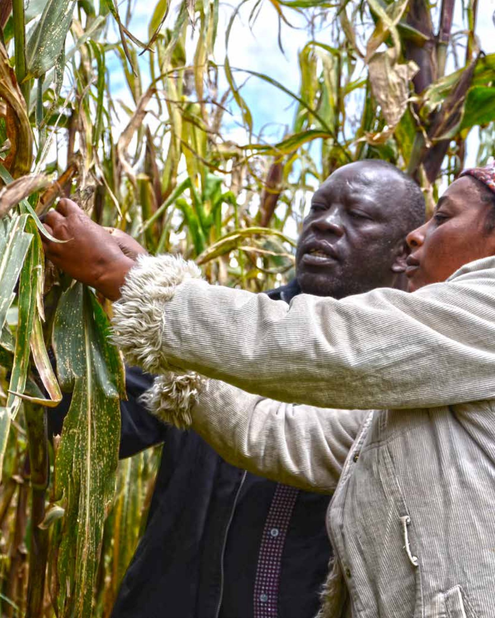
Farmers examine crop in Nyandarua, Kenya