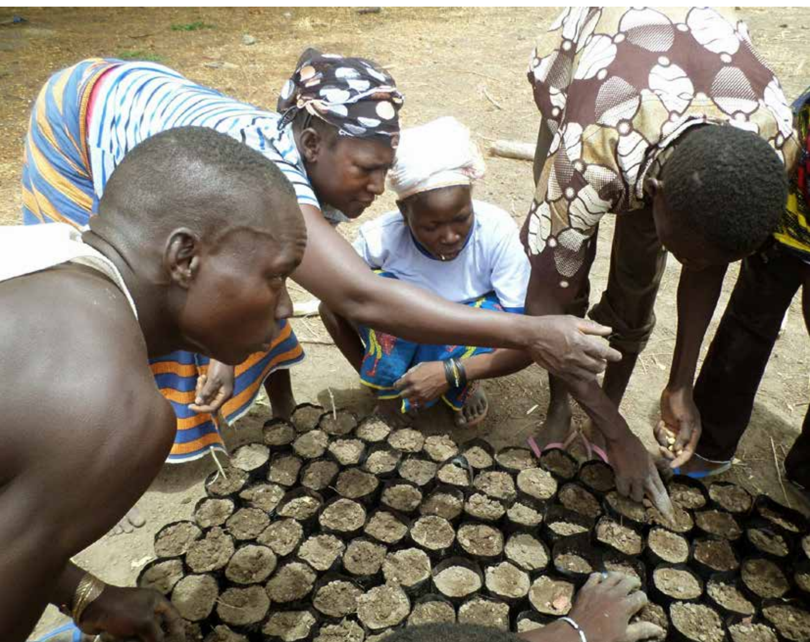
There are measures address gender issues in Burkina Faso.

Analysing this generic Theory of Change and its associated roles with a gender lens offers a general framework for gender mainstreaming in the overall research agenda; it also helps demonstrate the relevance of gender analysis and how it informs the achievement of ICRAF's vision and goals. Table 1 provides an overview of what integrating gender in each of ICRAF's six roles would require.