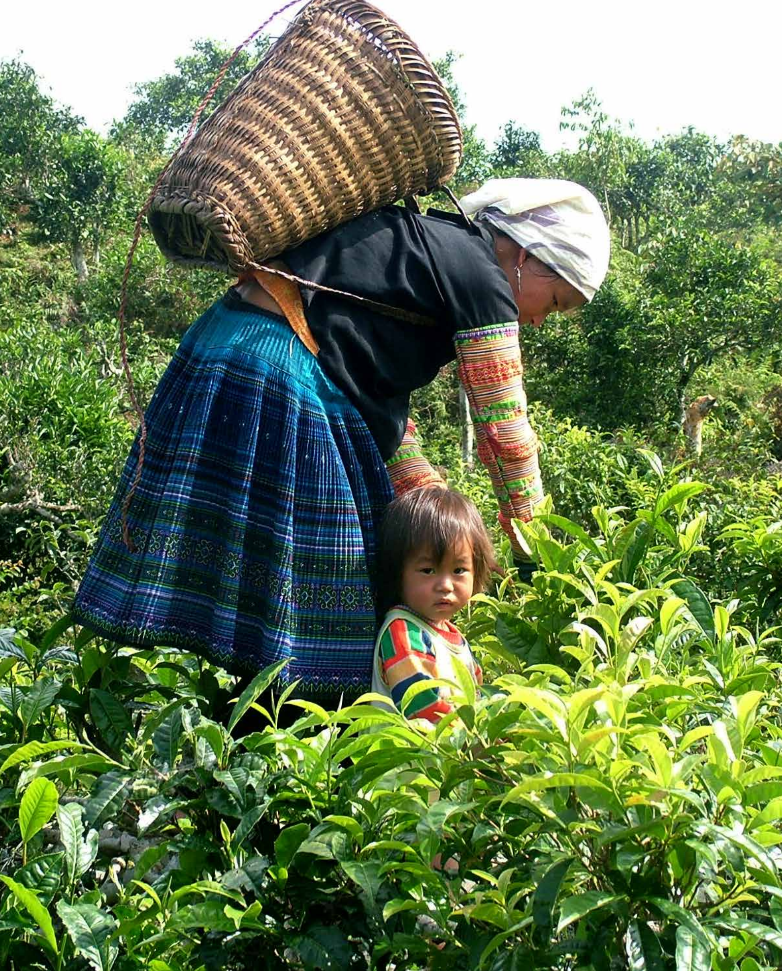
H'mong woman with her child picking indigenous Shan tea leaves.