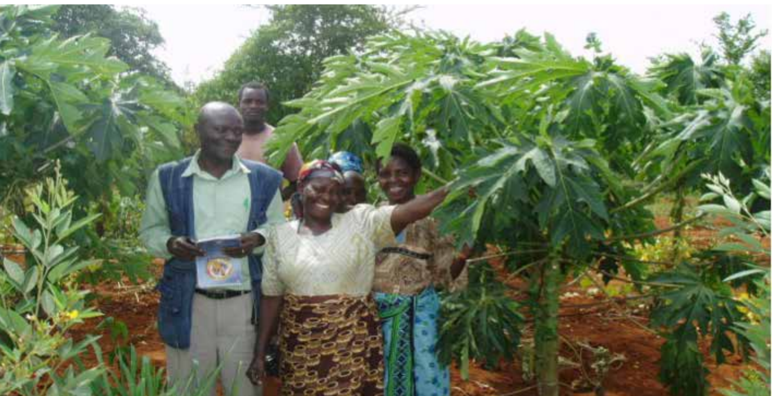
A proud Kenyan woman farmer with her papaya orchard.