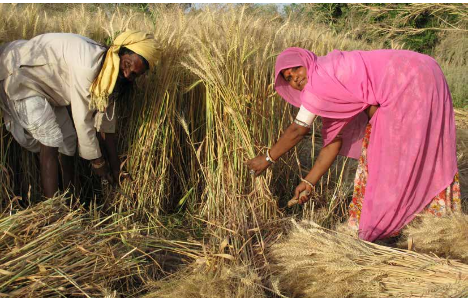
Wheat harvesting in Rajasthan, India.

To achieve significant impacts on development challenges, ICRAF’s research needs to rigorously address gender equality and women’s empowerment issues in agriculture and natural resource management. To do that, the Centre must dedicate efforts and resources to integrate gender considerations across its research programmes to enable the production of gender-responsive knowledge and innovations. Research that does not recognize the inherent differences that exist between men and women – and the inequalities that are often complexly intertwined with clan, ethnicity, and other modes of social differentiation – run the risk of being irrelevant. Such research can even create unintended consequences that are adverse to poor women smallholders and their households.