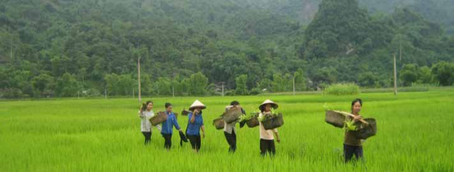
Long way to go- Vietnamese women farmers in rice fields