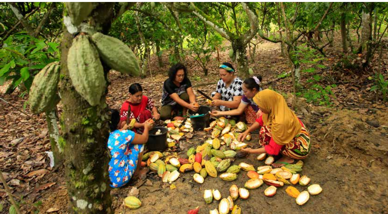
Women farmers in South East Sulawesi gather ripe pods and split them open.

ICRAF's Human Resources Unit is developing a complementary strategy on gender and workplace diversity. This companion document will focus on innovative practices and management systems that engender a diversity-inclusive workplace. It will set out clear policy guidelines to create and maintain such an enabling organizational environment.