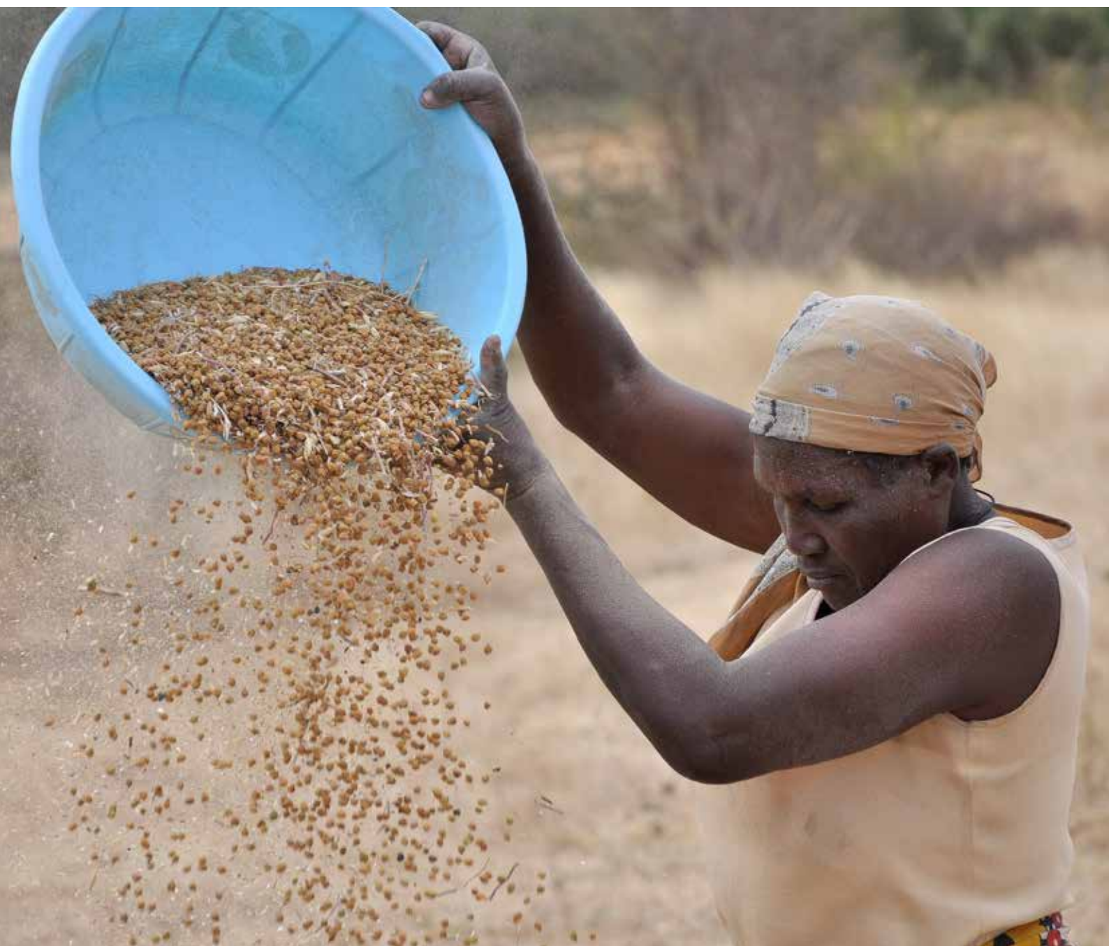
A hard day labour for a Kenyan woman winnowing chick peas grown at her farm.