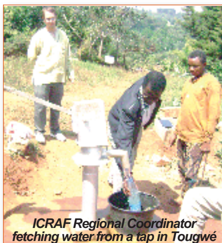
ICRAF Regional Coordinator fetching water from a tap in Tougwé

T ougwé is one of the communities that make up Bayangam. It is made up of three neighbourhoods; Yenom, Meudjeh and Mpouh. Situated on a very hilly site of Bayangam, the population of this area has for long suffered from the critical problem of potable water. In the past, during the dry season, they had to go to very far off distances to fetch potable water which was provided by a well-to-do member of the locality. This person had dug a bore hole and used it in his compound. He was kind enough to allow the rest of the community fetch water from his source. He however connected a tap outside that supplies the rest of the community twice a week. So, this population had to collect water from this man's compound and store for consumption. This exercise has never been easy especially because of the number of people who turn out to collect this water and the quantity that is available for them. It was sometimes very difficult in this village for a passerby to ask for potable water and get the opportunity to be served. They relied mostly on