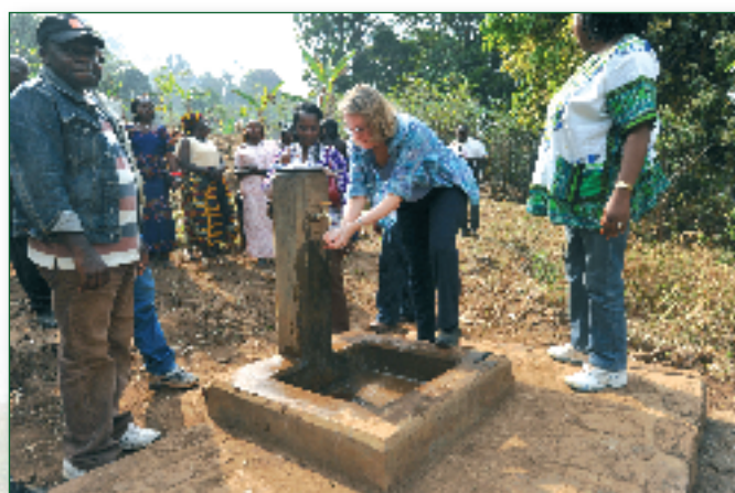
A public tap constructed by CANADEL in Belo

till September 2010. The project seeks to enhance the agricultural, tree crop and medicinal plant production and marketing in the West and North West Regions and it is financed by USDA and the Government of Cameroon.