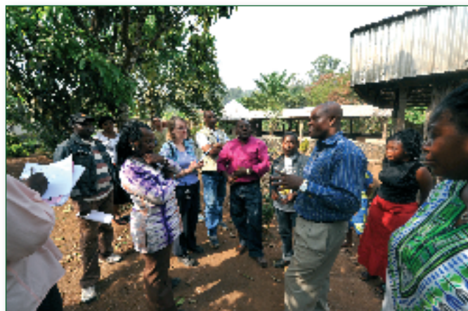
Listening to how a resource centre functions in Belo