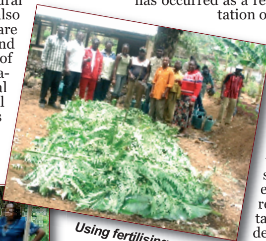
Using fertilising species

once successful in specific farming systems in Europe and Asia, is not the appropriate approach in the diverse smallholder farming systems in Africa. In this new approach, smallholders are actively involved in the process, which focus on technology development and innovations geared to the specific physical, climatic, economic and social circumstances of smallholders and integrate this technology development in a process of making a more comfortable environment for smallholders to do business.