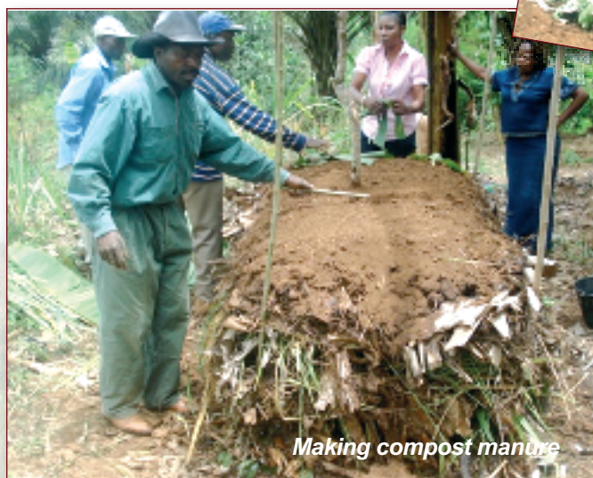
Making compost manure