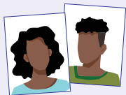
Gender position bar cards (see Appendix 1, p.17)