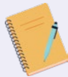
Notebooks (drawing book) and pens for each participant