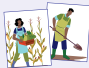
Role-play situation cards (see Appendix 2, p.18)