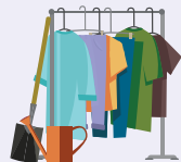
Props for role-play activity (e.g., men's and women's clothes, household items)

To encourage good discussion and participation, it's recommended to keep the groups small, ideally with a maximum of 15 participants . It is also important to have a mix of men and women across different age groups attend the dialogue and, if possible, invite married couples to attend. This is because many of the activities focus on relationships within households (particularly, activities 5 and 6) and are best conducted with couples.