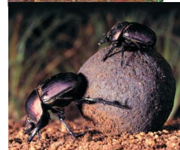
A pair of dung beetles rolling animal manure to their nest