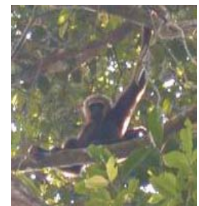
Hylobates agilis (gibbon)