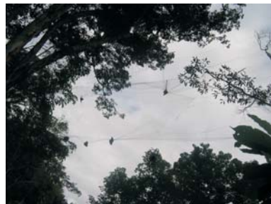
Mist net trap