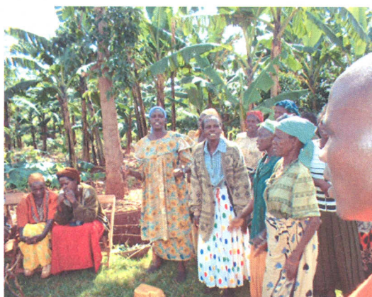
Figure 3. Reflect cycle meeting to distill integrated evaluation criteria (income, NRM, value to other farm enterprises and cultural acceptance) to compare new with traditional Banana cultivars in Bundibugyo, Uganda