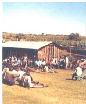
Figure 2. Village-level training by AGILE facilitators on the recognition of local level assets and actors and their employment in achieving integrated enterprise-NRM visions in Kapchorwa, Uganda

AGILE builds upon existing institutional and community strengths to foster a more comprehensive, coordinated development paradigm linking conservation and livelihood goals. Reflect farmer learning cycles coupled with dynamic facilitation have enabled more effective change processes in support of these goals.