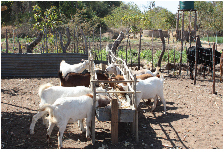
Figure 4.3 Supplementary dry season feeding of velvet bean and maize while the animals are still mostly grazing communal pastures. Due to shortage of dry season feed and protein availability in diets forage crops are widely adopted in this area where they are promoted. The farmer is a leading innovator selling animals to invest in feed and water source development.

Livestock provide food and income (milk and meat), soil fertility inputs (manure), and draught power for field activities, crop processing and transport. They are also a self-reproducing asset that can be built up as a source of savings and store of wealth. Cash from livestock sales is invested into purchased farm inputs including fertilizer, seed, water pumps and veterinary inputs to improve farm productivity. They are also sold to purchase food and to satisfy other needs during difficult times, and to meet social and religious obligations (Powell et al. 2004). In southern and eastern Africa, cattle are the dominant livestock, although donkeys and small ruminants (goats, sheep) become more important in the driest areas (Figure 4.3). In places affected by long cycles of drought, there has been a shift from cattle to small ruminants, as they are less costly, better adapted to drought, easier to feed and they reproduce faster than cattle (Mortimore and Adams 2001).