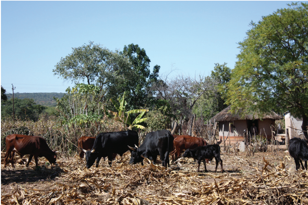
Figure 4.7 Cattle grazing maize stover near homestead, Nkayi district, Zimbabwe.

Yield increases from improved sorghum varieties can also be expected, subject to the use of both micro-dose fertilization and soil and water conservation techniques (e.g. 1400 kg/ha compared to 800 kg/ha for local varieties; Ouattara et al. 2018).