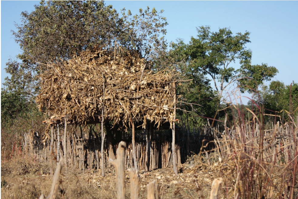
Figure 4.5 With communal access arrangements there is increasing privatization of crop residues for feed. Local by-laws determine the date when fields need to be open for communal grazing. Farmers who intend to save crop residues have to store them away from livestock access, for instance on stover platforms.