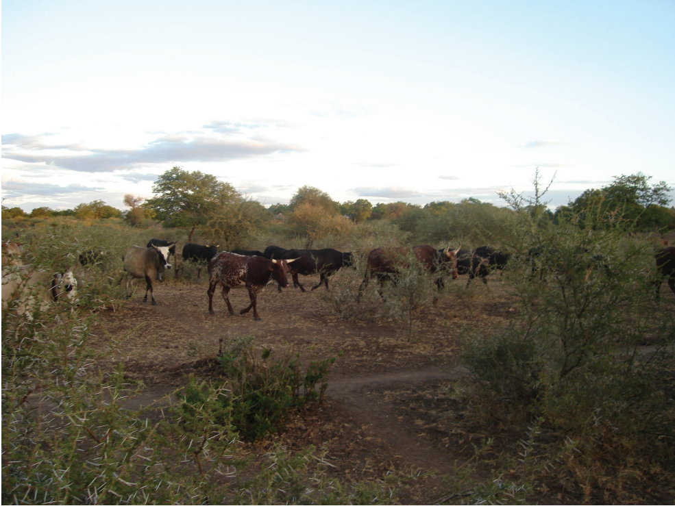
Figure 4.2 Cattle form the backbone of livelihoods in the southeastern lowveld of Zimbabwe Limpopo Valley. They are used for draught power and milk production; most importantly cattle are traded during drought years for maize with farmers in less affected areas. Southeastern Zimbabwe is known as the sweet veld because the bulk of grasses found in this region do not lose nutritional value to levels below maintenance for cattle. Browsing of Mopane tree leaves helps close the dry season food gap when grass biomass is insufficient.