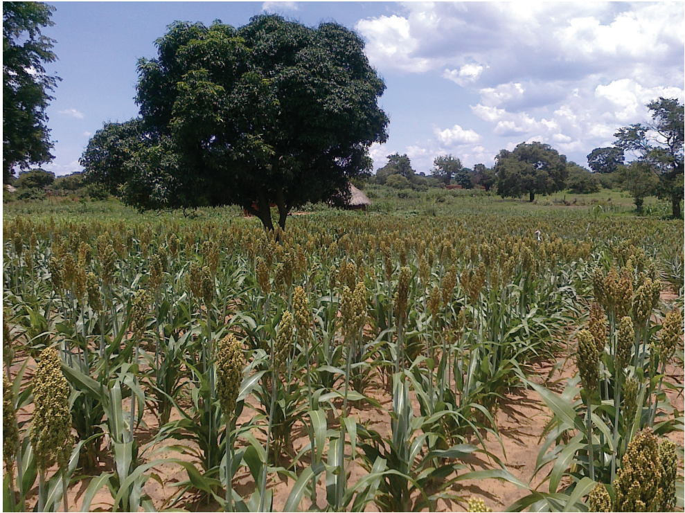
Figure 4.6 Dwarf SV2 sorghum variety grown on farm released by the Zimbabwean Government Small Grains Breeding Program in close collaboration with ICRISAT and widely found in Southern Africa. Due to various agronomic challenges and moisture stress, grain yields are about 500 kg/ha.