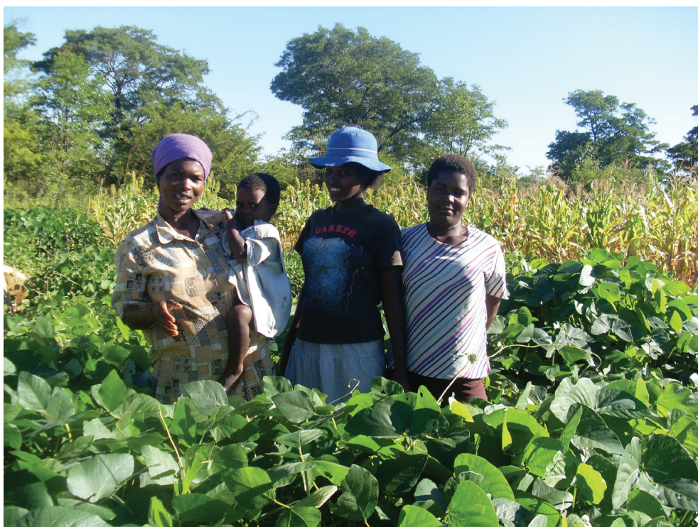
Figure 4.8 Family field of velvet bean ( Mucuna spp.) promoted for dry-season feeding of livestock, Gwanda district, Zimbabwe. While interest for Mucuna as a cover crop is limited, there is now a large uptake as feed with strong interest by women.