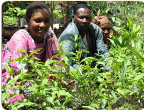
▲ Members of the Mboyni Farming Group in one of the many satellite nurseries established with the help of a rural resource centre.