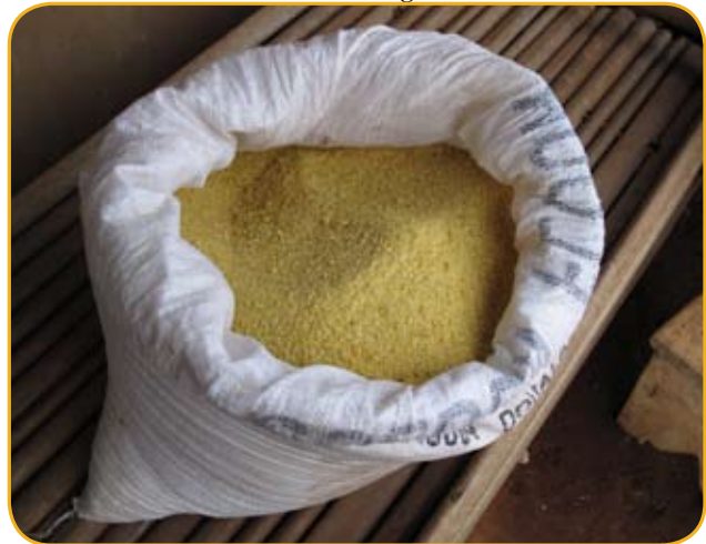
▲ A sack of gari, made from cassava.

These women are among the many thousands of people to benefit from an innovative and multi-faceted development programme funded by the United States Department of Agriculture (USDA) through the Food for