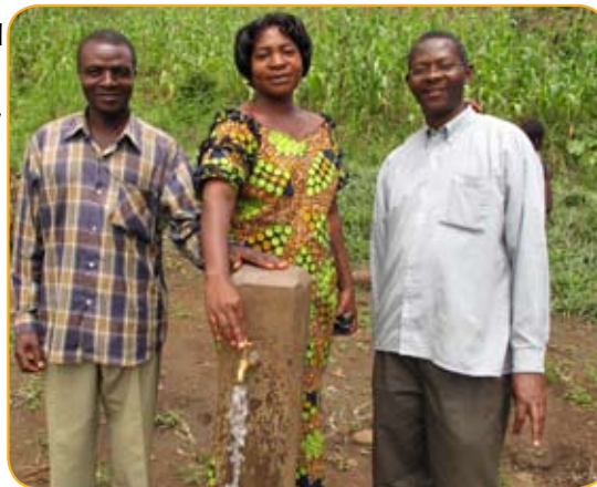
▲ Members of the Njinikédjem Water Management Committee with one of their new standpipes.