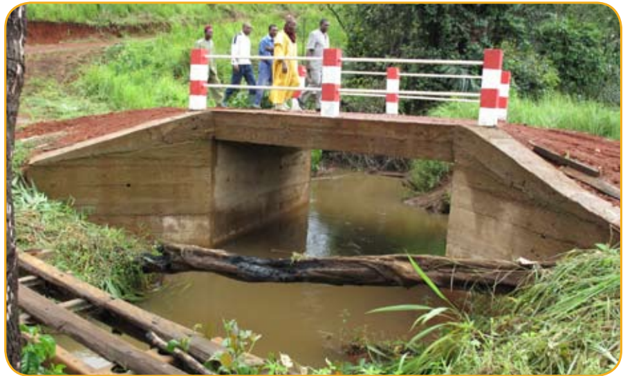
▲ The old and new. Note the remnants of an ancient and inadequate bridge in the foreground.

The bridge was one of four possible projects considered by CANADEL and the community. "When CANADEL arrived, we had a long process of consultation,"