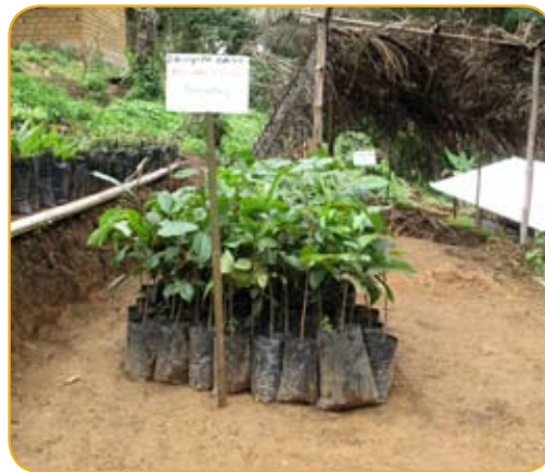
▲ Income-generating activities have helped to improve nursery sales. African plum seedlings ready to be planted out.

In many areas, the marketing of improved planting materials has led to a significant increase in income. For example, during the past five years, plant sales have generated between 5 million CFA francs (US$11,100) and 10 million CFA francs (US$22,200) for MIFACIG Rural Resource Centre. Sales have been on a smaller scale at RIBA, but the number of plants in its nursery rose from 600 to 21,000 between 2007 and 2008, and sales from 40,000 CFA francs (US$88) to 600,000 CFA francs (US$1330) during the same period.