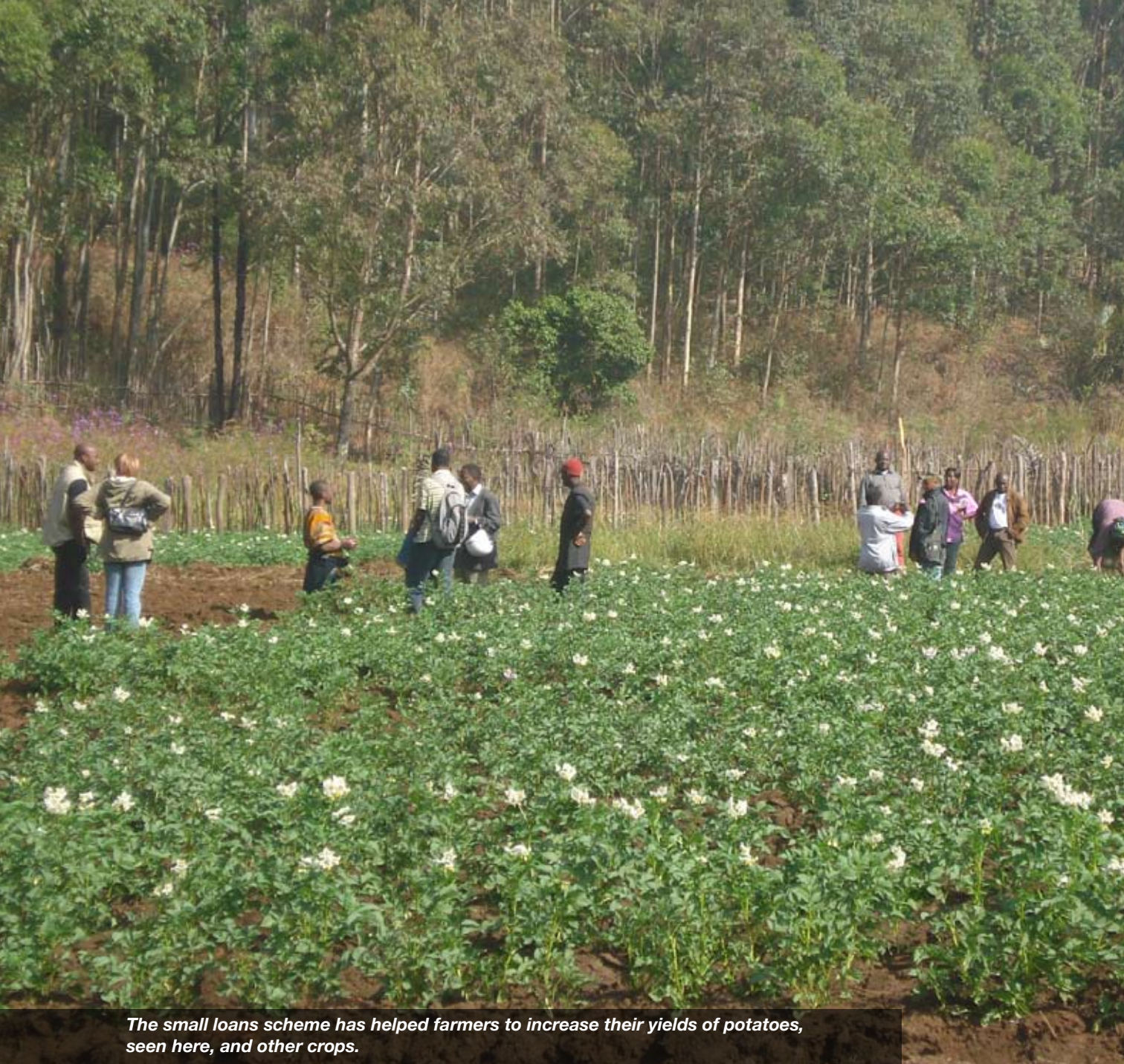
The small loans scheme has helped farmers to increase their yields of potatoes, seen here, and other crops.