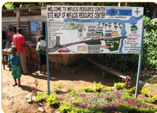
▲ By mid-2009, MIFACIG Rural Resource Centre had provided training for 2500 farmers.

During their early years, nurseries make little in the way of profits, but once they