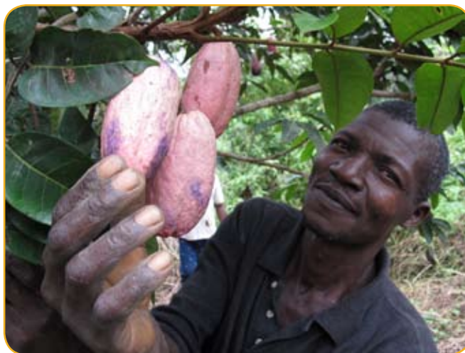
▲ Many farmers have increased their income by growing superior varieties of indigenous fruit trees like African plum.

At RIBA, intercropping with nitrogen-fixing species such as Calliandra , Sesbania and Tephrosia has significantly improved soil fertility, leading to a doubling in crop yields. Boundary trees have been planted to act as windbreaks and the woodlot on the hilltop provides fodder for livestock and a habitat for