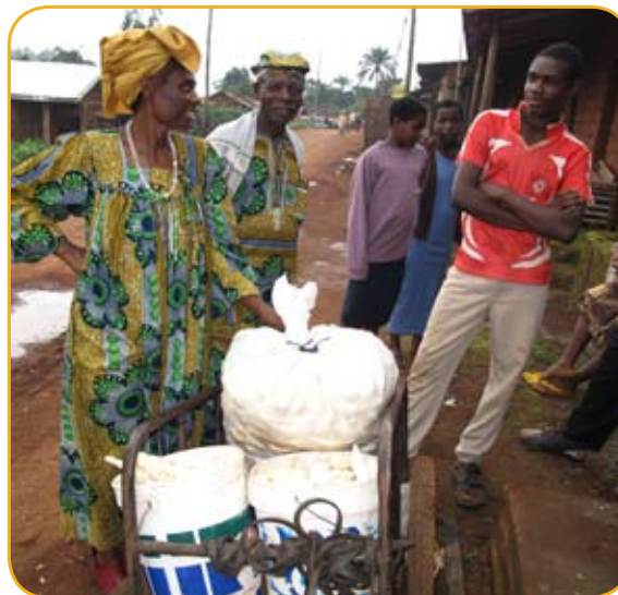
▲ Many farmers now pay the Mambu Self-help Women's Group to process their cassava.