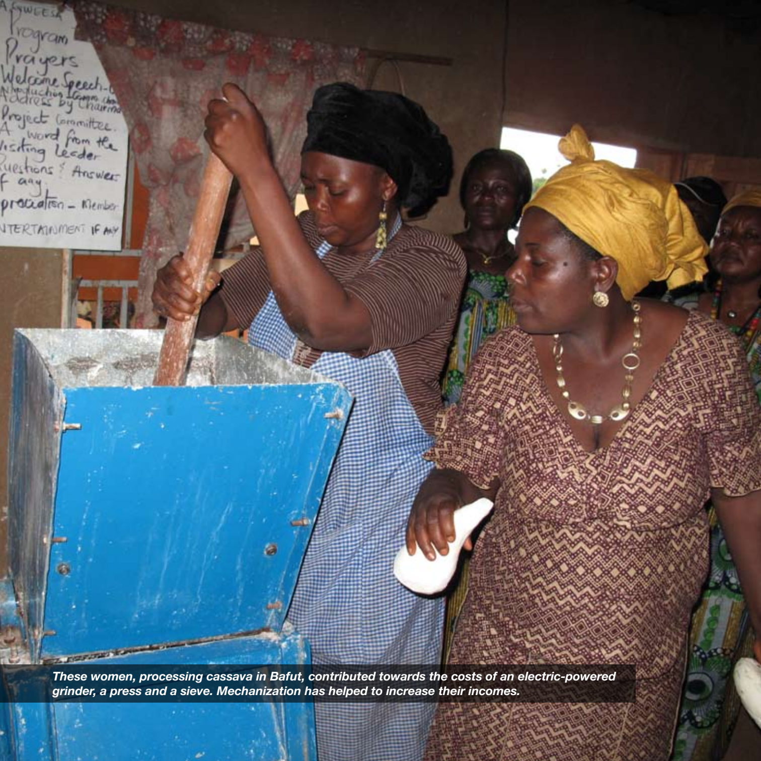
These women, processing cassava in Bafut, contributed towards the costs of an electric-powered grinder, a press and a sieve. Mechanization has helped to increase their incomes.