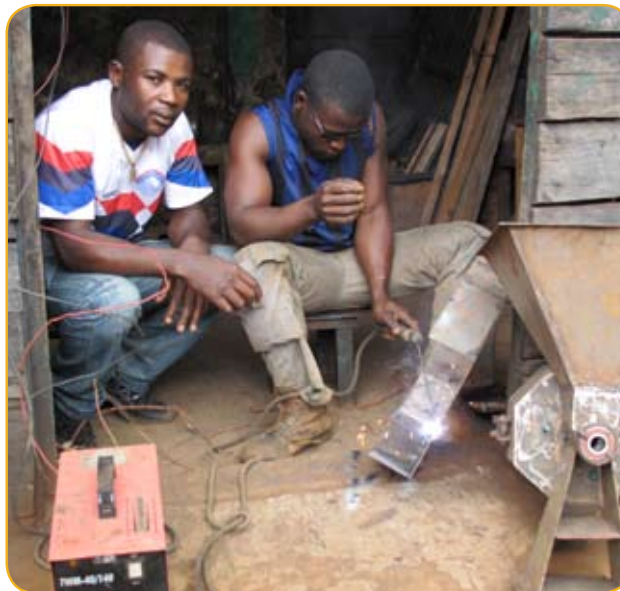
▲ A welder working on a Winrock-designed machine at Winco International's workshop in Bamenda.

Winrock has developed several machines under the auspices of the Agricultural and Tree Products Program. During 2009, its promotional campaign encouraged the