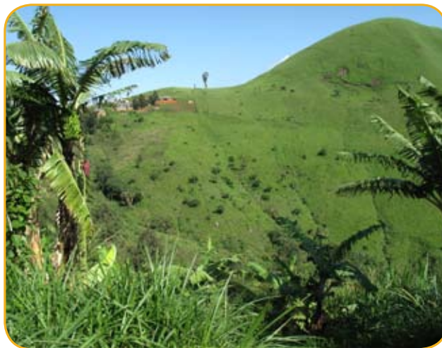
▲ A degraded landscape in the Western Highlands.

The programme has encouraged farmers to increase agricultural production by improving soil fertility and integrating high value, indigenous tree species into their production systems. Income-generating activities have helped to improve the