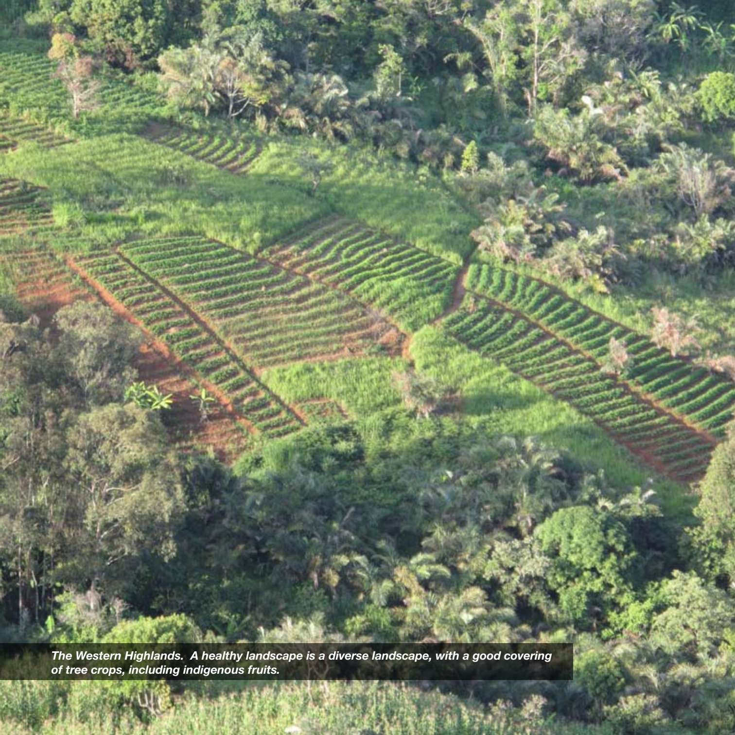
The Western Highlands. A healthy landscape is a diverse landscape, with a good covering of tree crops, including indigenous fruits.