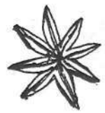
empty star-shaped capsule