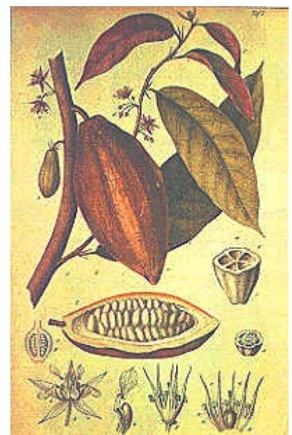
Drawing of Cocoa Pods.

In Asia, public and private plantations have been developed as well as the small farms.