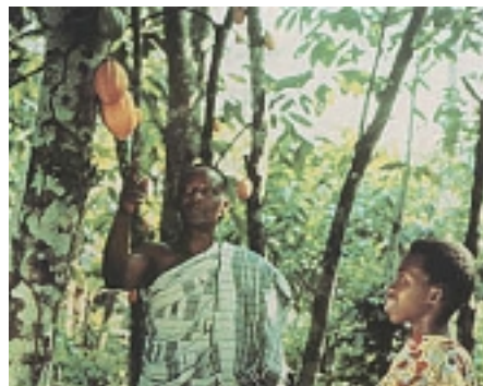
Picking Cocoa pods