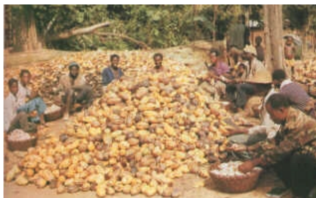
A pile of Cocoa Pods

Traditionally the HEAP method is used on the farms in West Africa . Wet cocoa beans, surrounded by the pulp, are piled on banana or plantain leaves which are spread out in a circle on the ground. More leaves are put on top to cover the heap and it is left for 5-6 days, turning to ensure even fermentation. Cocoa is also fermented in baskets lined and covered with leaves - a method used in Nigeria.