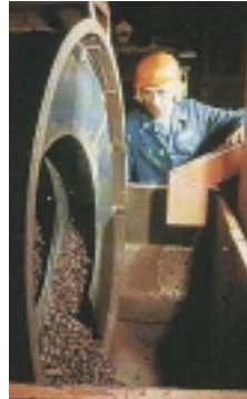
Sorting Cocoa Beans

Cadbury's cocoa factory at Singapore operates 24 hours a day, seven days a week, producing the basic ingredients from which all Cadbury chocolate products are made. 18,000 tonnes of cocoa beans are processed each year using the latest technological control systems to ensure that the end product is of the highest quality. On arrival at the factory, the cocoa beans are sorted and cleaned. They are then treated through a microniser to break the shell and a winnower to remove the shell. The beans are broken down into small pieces called nibs and are subsequently roasted at a temperature of 135°C. The actual roasting time depends on whether the end use is for cocoa or chocolate.