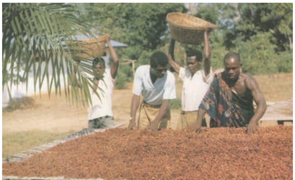
Beans spread out to dry

The cured beans are packed into sacks for transportation to Singapore where Cadbury process the cocoa beans. Stringent quality control procedures are carried out as samples are checked to ensure that standards are maintained before cocoa beans are bought from the farmer and again during transportation.