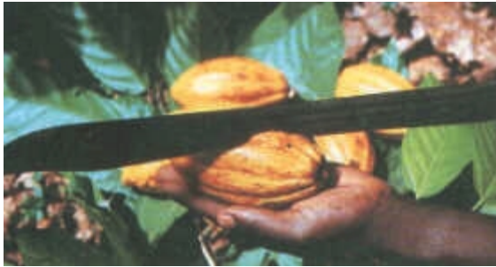
Splitting open a Cocoa Pod

The harvesting of the pods is very labour intensive and on the West African small-holdings the whole family, together with friends and neighbours help out. Ripe pods are gathered every few weeks during the peak season.