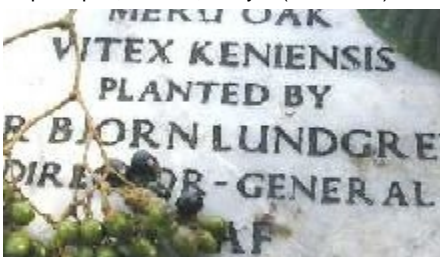
Vitex keniensis specimen at the Nairobi arboretum. (AFT team)