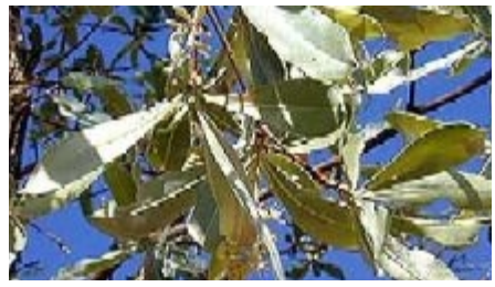
The leaves are clustered towards the tips of the branches; 55-120 x 15-45 mm large and densely covered with silky, silvery hairs. The branchlets are dark brown or purplish; peeling in rings and strips. (Botha R)