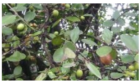
Fruit and foliage (Bob Bailis)

Dispersal of seeds in T. nobilis seems to rely little on frugivorous birds.