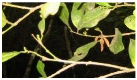
T. nobilis leaves