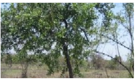
Tree growing in Masai land Kenya (Bob Bailis)