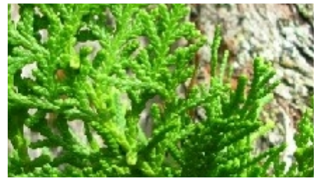
Leaves at Waikamoi trail, Maui, Hawaii.