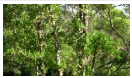
Trees at Waikamoi trail, Maui, Hawaii.