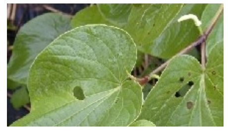
Leaves and inflorescence at Nahiku, Maui, Hawaii.