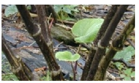
Stems at Nahiku, Maui, Hawaii.

Kava reproduction is asexual. Although the species is dioecious, most plants are male; female plants are very rare. Occasionally monoecious plants are found. Once established the older stolons enlarge to form a short rootstock, from which new shoots grow. Additional shoots arise at the periphery of the crown throughout the plant life. Natural senescence occurs at 15-30 years after planting.