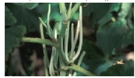
Habit at Maui Nui Botanical Garden, Maui, Hawaii.