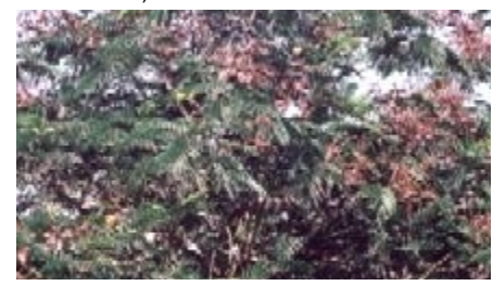
Flowers and pods on the inner branches of the tree (Gassouma S.)