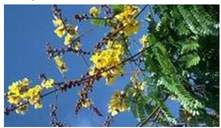
Flowers and foliage