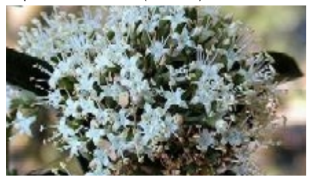
A shrub or medium-sized evergreen tree. The flowers are in dense, congested terminal heads, small, white and fragrant. (Botha AD)