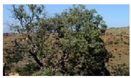
A rounded evergreen shrub or small tree. A widespread species, here growing in exposed conditions. (Ellis RP)

N. congesta is monoecious, flower buds appear in autumn and develop slowly before blooming.