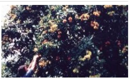
N. lappaceum tree with fruits. (Chris Gardiner)

The perfect flowers are functionally pistillate or staminate. Most commercial cultivars behave hermaphroditically and are self fertile, with 0.05-0.9% of the functional females possessing functional stamens. Insect pollination is necessary. Depending on the cultivar, flowering may spread over a period of 23-38 days, with an average of 3.4% setting fruit. Fruits may be produced in large bunches, with 40-60 fruits/panicle, but most often only 12-13/panicle are retained to maturity. Final fruit set is usually between 0.7-1.45%. Time required from fruit set to harvest is about 105-115 days.