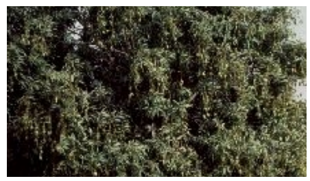
The mango tree, Mangifera indica, at the end of the dry season in Burkina Faso. While everything else is dry at this time of the year, this tree is dark green and full of juicy fruits.

Rain and high humidity at blossoming reduce pollination and fruit setting. Usually only small proportions of the flowers develop into fruit. Hermaphrodite flowers are predominantly outcrossing and exhibit