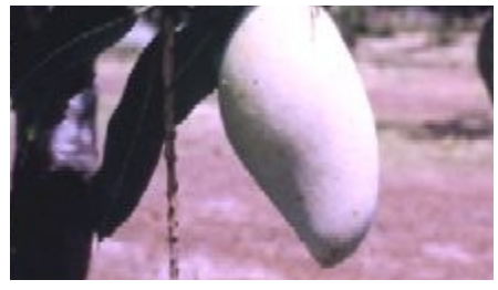
M. indica fruits.