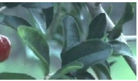
Fruits and foliage

In Puerto Rico flowering appeared to be independent of the daylength and several cropping periods are possible per year, especially with alternating dry and rainy periods. The flowers are pollinated by insects; honey bees substantially improve fruit set. Self- and cross-incompatibiliy have been reported. Fruits ripen completely 3-4 weeks after flowering. In Puerto Rico the large-fruited (up to 20 g/fruit) selection B-15 is most important.