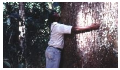
Mature tree in Kakamega Forest, Kenya