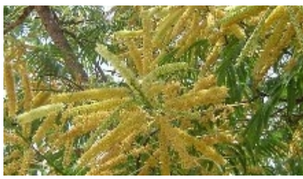
flowers

Flowering takes place during the rainy season, and the fruit ripens towards the end of the rainy season, extending into the dry season. In Nigeria it flowers from January to March and from May to August. In Sudan it flowers in June and fruits in November.