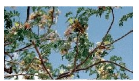
Flowers: Showy attractive flowers of D. elata from the hills south of Las Caanood, northern Somalia.

D. elata is a hermaphroditic, deciduous tree. Flowers in the hot season or during the early rains, in east Africa this is normally around December and August-March in India. Fruit ripening is between May and July.