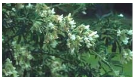
foliage (Western weeds)

In southern Australia, flowers appear in early spring (July-September) and pods ripen in November-December.