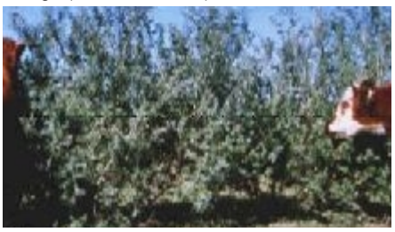
Cattle grazing Chamaecytisus palmensis in southwestern Western Australian (Shelton H.M.)